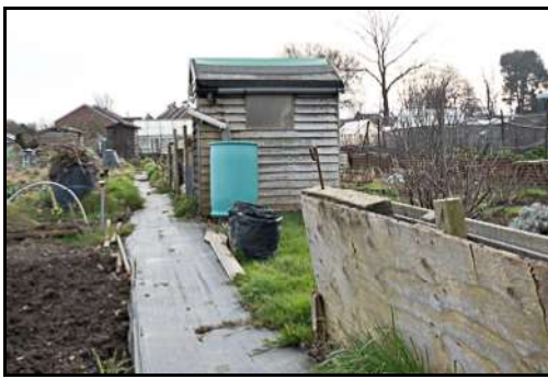
DSCF8727 ISO 160 X-T3 1/30 sec at f / 13