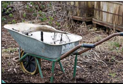
DSCF8749 ISO 400 X-T3 1/80 sec at f / 8.0