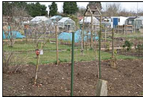
DSCF8883 ISO 400 X-T3 1/400 sec at