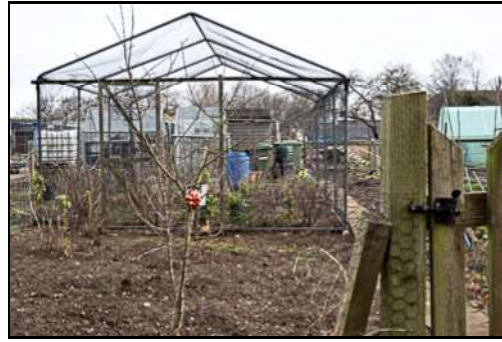
DSCF8880 ISO 400 X-T3 1/400 sec at