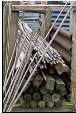
DSCF8776 ISO 400 X-T3 1/60 sec at f / 8.0