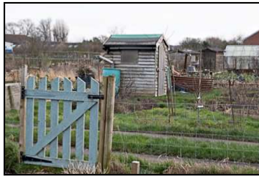
DSCF8838 ISO 500 X-T3 1/250 sec at