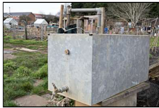
DSCF8804 ISO 400 X-T3 1/125 sec at f / 6.4