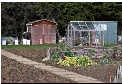
DSCF8823 ISO 400 X-T3 1/125 sec at f / 6.4