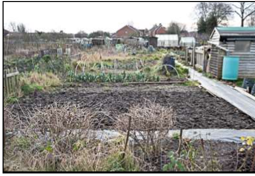
DSCF8876 ISO 400 X-T3 1/320 sec at