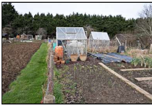
DSCF8818 ISO 400 X-T3 1/160 sec at f / 6.4