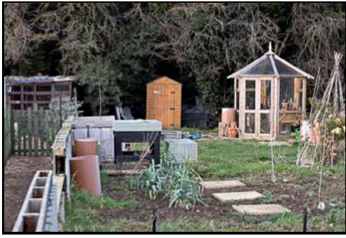
DSCF8850 ISO 500 X-T3 1/160 sec at