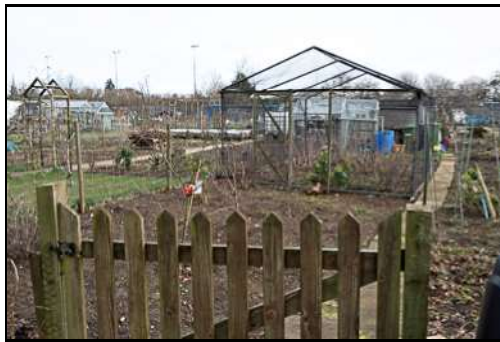
DSCF8882 ISO 400 X-T3 1/400 sec at