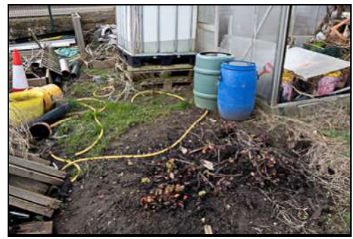
DSCF8889 ISO 400 X-T3 1/160 sec at