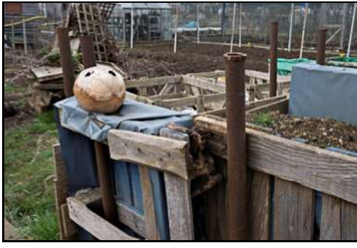
DSCF8790 ISO 400 X-T3 1/160 sec at f / 6.4