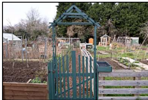
DSCF8841 ISO 500 X-T3 1/125 sec at