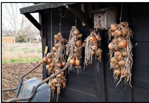
DSCF8829 ISO 500 X-T3 1/100 sec at f / 5.6