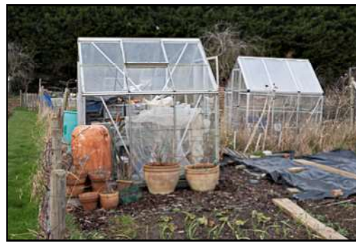
DSCF8819 ISO 400 X-T3 1/160 sec at f / 6.4