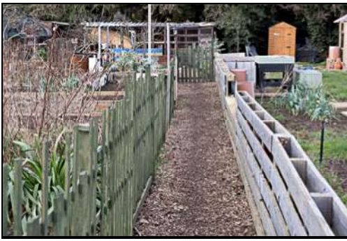
DSCF8848 ISO 500 X-T3 1/160 sec at