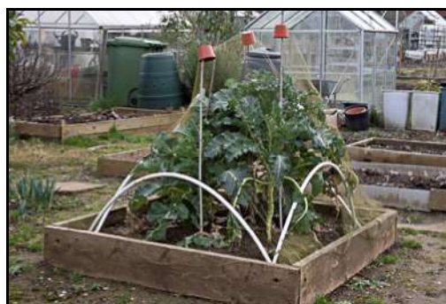
DSCF8769 ISO 400 X-T3 1/160 sec at f / 8.0