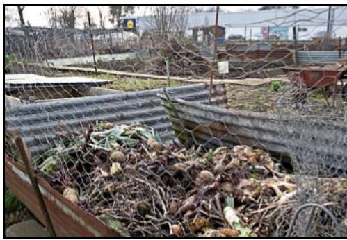
DSCF8728 ISO 160 X-T3 1/25 sec at f / 13