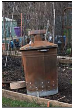
DSCF8797 ISO 400 X-T3 1/160 sec at f / 6.4