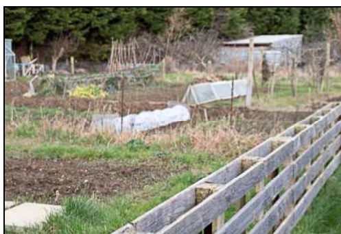
DSCF8845 ISO 500 X-T3 1/160 sec at