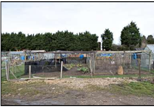
DSCF8867 ISO 400 X-T3 1/500 sec at