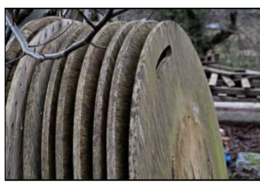
DSCF8813 ISO 400 X-T3 1/125 sec at f / 6.4