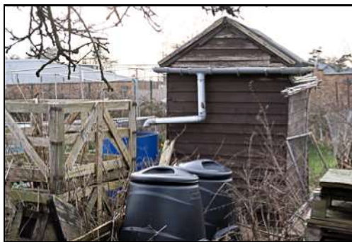
DSCF8842 ISO 500 X-T3 1/160 sec at