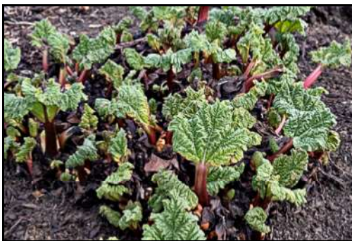
DSCF8751 ISO 400 X-T3 1/60 sec at f / 8.0