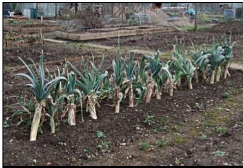
DSCF8764 ISO 400 X-T3 1/100 sec at f / 8.0