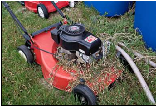
DSCF8793 ISO 400 X-T3 1/100 sec at f / 6.4