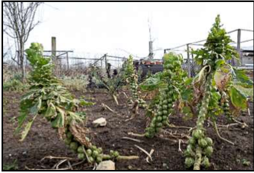
DSCF8878 ISO 400 X-T3 1/200 sec at