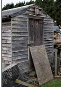
DSCF8800 ISO 400 X-T3 1/200 sec at f / 6.4