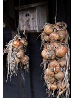
DSCF8831 ISO 500 X-T3 1/100 sec at f / 5.6