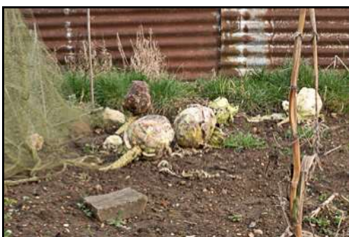
DSCF8739 ISO 400 X-T3 1/160 sec at f / 8.0