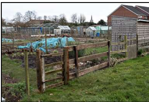
DSCF8754 ISO 400 X-T3 1/160 sec at f / 8.0