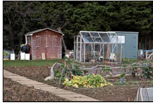
DSCF8822 ISO 400 X-T3 1/125 sec at f / 6.4