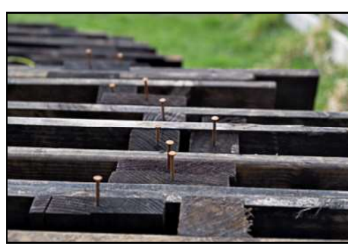
DSCF8828 ISO 500 X-T3 1/100 sec at f / 5.6