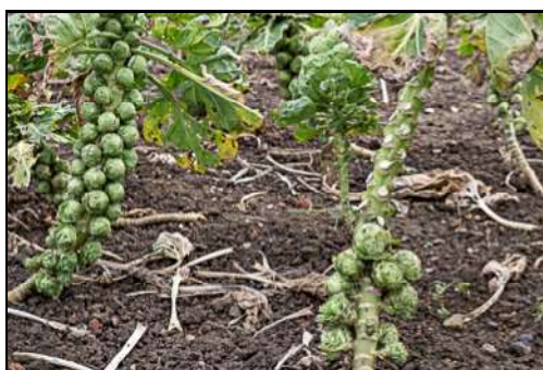
DSCF8740 ISO 400 X-T3 1/80 sec at f / 8.0