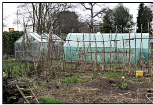
DSCF8789 ISO 400 X-T3 1/200 sec at f / 6.4