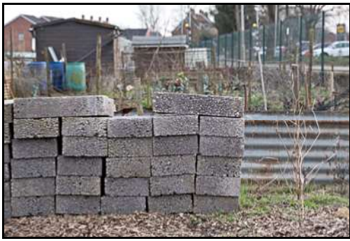
DSCF8853 ISO 500 X-T3 1/160 sec at