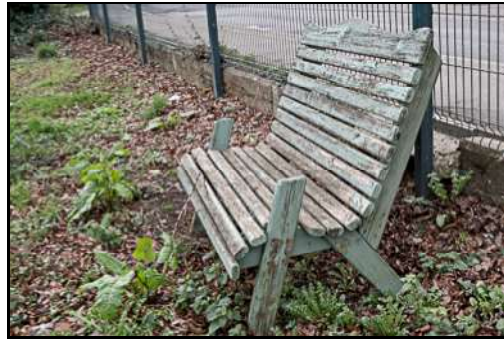
DSCF8760 ISO 400 X-T3 1/80 sec at f / 8.0