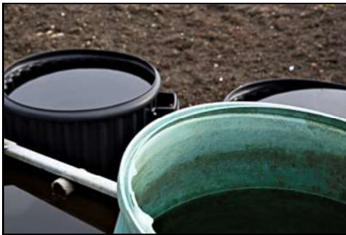
DSCF8733 ISO 160 X-T3 1/50 sec at f / 8.0