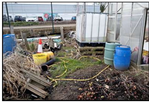
DSCF8887 ISO 400 X-T3 1/160 sec at