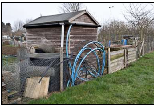
DSCF8772 ISO 400 X-T3 1/100 sec at f / 8.0