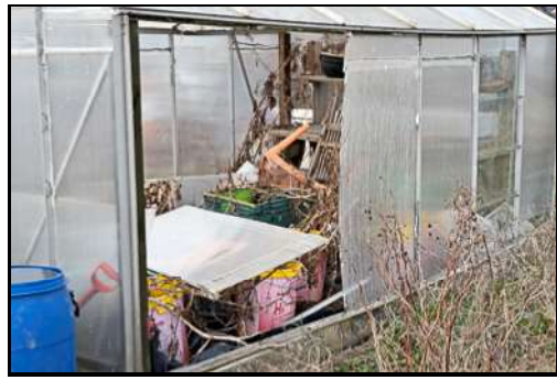
DSCF8890 ISO 400 X-T3 1/160 sec at