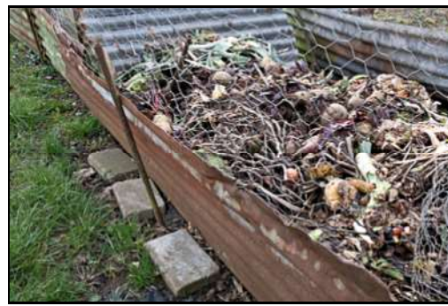
DSCF8729 ISO 160 X-T3 1/25 sec at f / 13