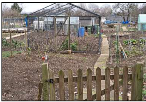
DSCF8758 ISO 400 X-T3 1/80 sec at f / 8.0