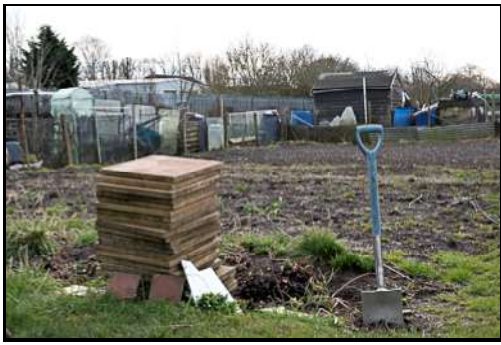
DSCF8872 ISO 400 X-T3 1/400 sec at