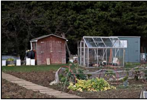
DSCF8820 ISO 400 X-T3 1/160 sec at f / 6.4