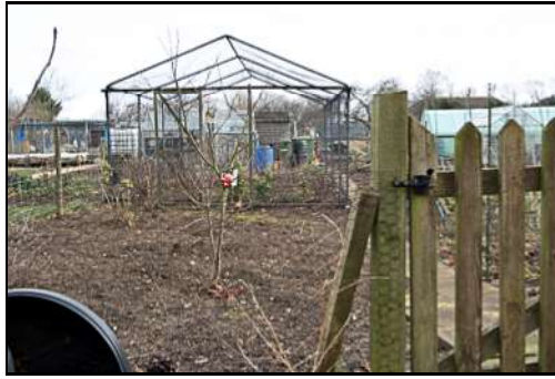
DSCF8879 ISO 400 X-T3 1/400 sec at