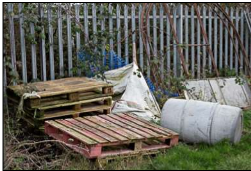
DSCF8779 ISO 400 X-T3 1/100 sec at f / 8.0