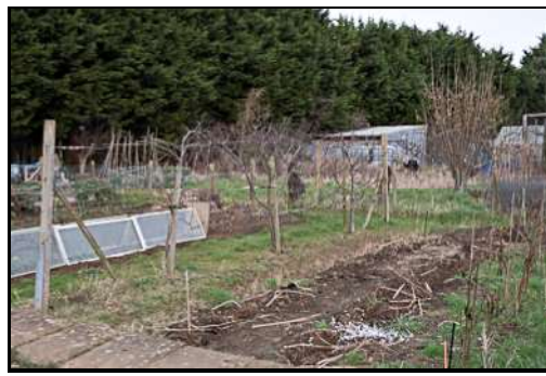
DSCF8832 ISO 500 X-T3 1/320 sec at