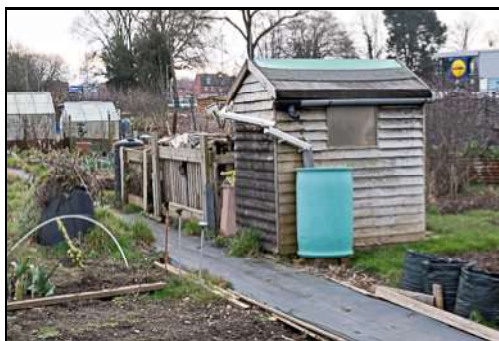
DSCF8815 ISO 400 X-T3 1/125 sec at f / 6.4