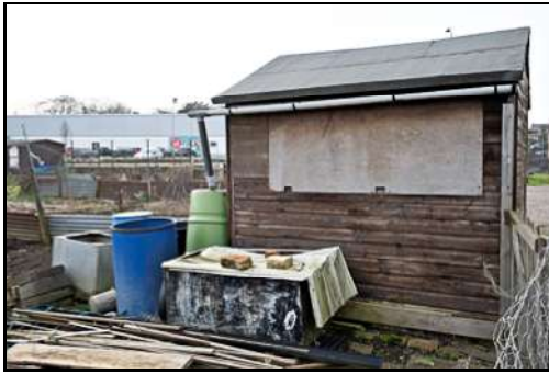
DSCF8730 ISO 160 X-T3 1/60 sec at f / 13