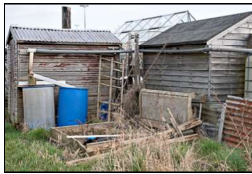
DSCF8744 ISO 400 X-T3 1/250 sec at f / 8.0