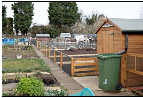
DSCF8868 ISO 400 X-T3 1/400 sec at