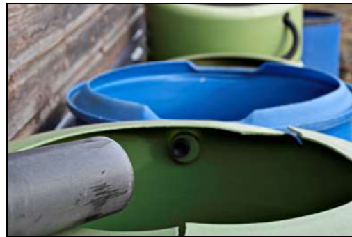
DSCF8735 ISO 400 X-T3 1/125 sec at f / 8.0