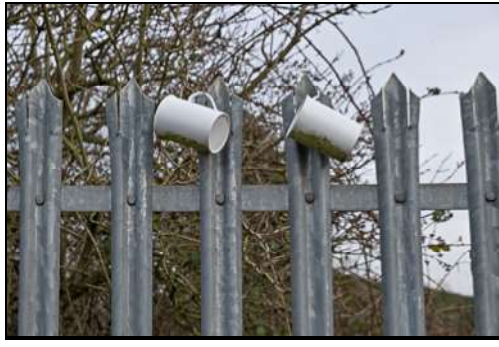
DSCF8794 ISO 400 X-T3 1/400 sec at f / 6.4