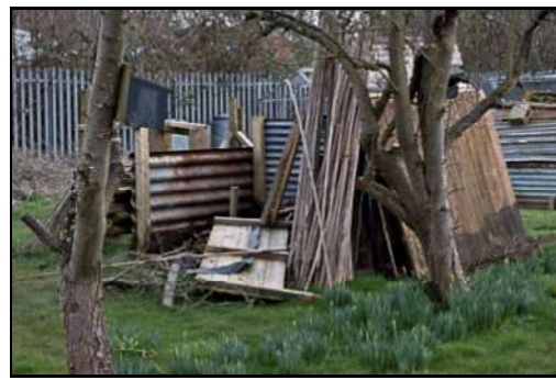
DSCF8774 ISO 400 X-T3 1/100 sec at f / 8.0