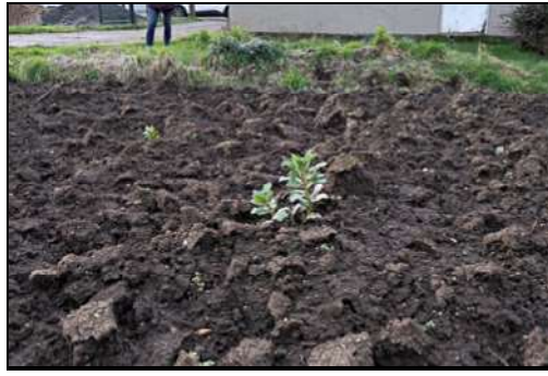
DSCF8852 ISO 500 X-T3 1/160 sec at