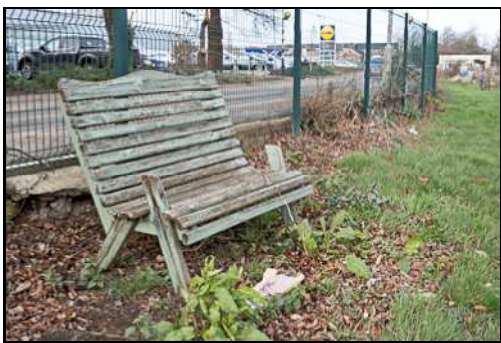
DSCF8884 ISO 400 X-T3 1/160 sec at