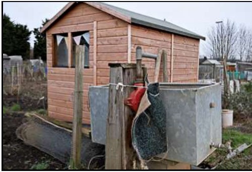
DSCF8805 ISO 400 X-T3 1/200 sec at f / 6.4