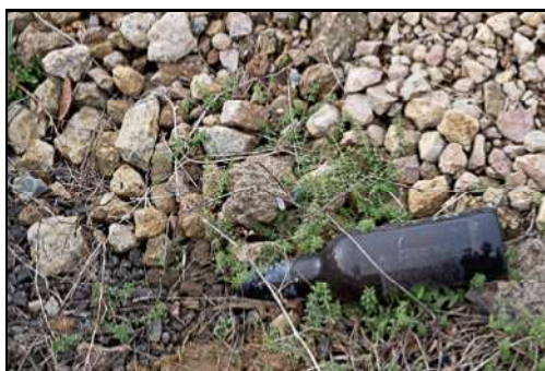
DSCF8737 ISO 400 X-T3 1/125 sec at f / 8.0