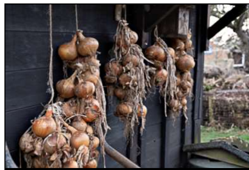
DSCF8825 ISO 400 X-T3 1/60 sec at f / 5.6