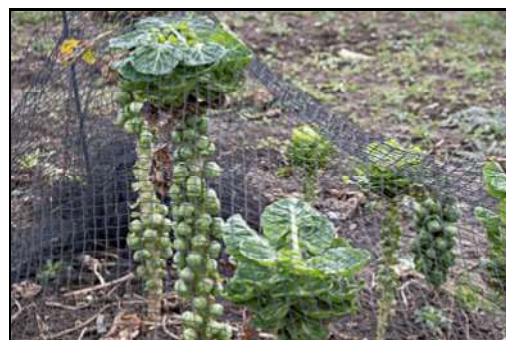
DSCF8738 ISO 400 X-T3 1/125 sec at f / 8.0