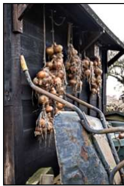
DSCF8827 ISO 500 X-T3 1/100 sec at f / 5.6