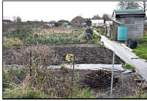
DSCF8877 ISO 400 X-T3 1/320 sec at