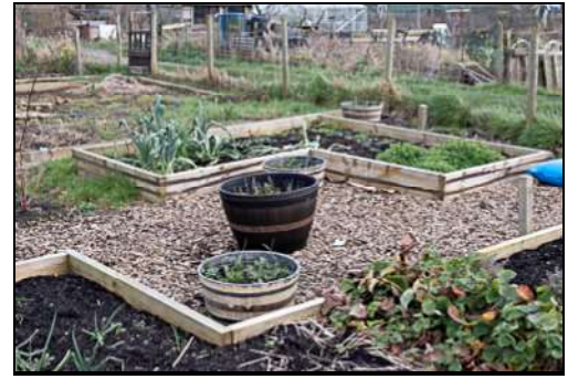
DSCF8837 ISO 500 X-T3 1/250 sec at