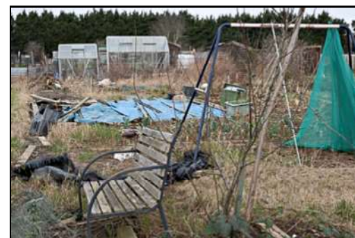
DSCF8768 ISO 400 X-T3 1/125 sec at f / 8.0