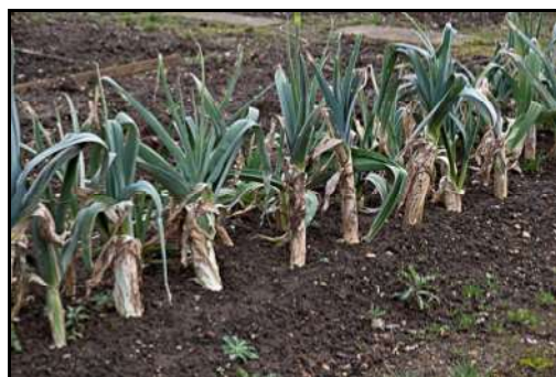
DSCF8766 ISO 400 X-T3 1/100 sec at f / 8.0