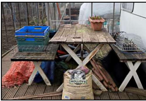
DSCF8787 ISO 400 X-T3 1/125 sec at f / 6.4