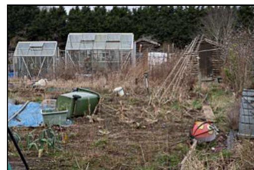
DSCF8771 ISO 400 X-T3 1/160 sec at f / 8.0