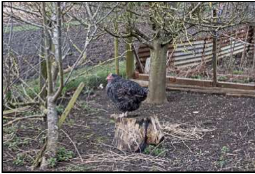
DSCF8775 ISO 400 X-T3 1/60 sec at f / 8.0