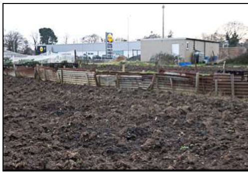
DSCF8833 ISO 500 X-T3 1/160 sec at