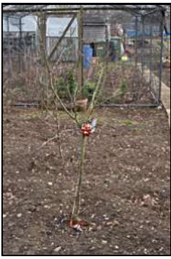
DSCF8757 ISO 400 X-T3 1/125 sec at f / 8.0