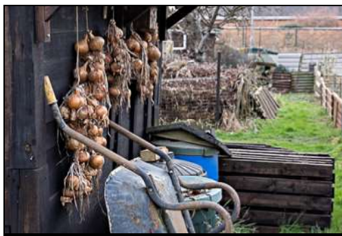
DSCF8824 ISO 400 X-T3 1/60 sec at f / 6.4