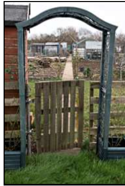
DSCF8761 ISO 400 X-T3 1/100 sec at f / 8.0