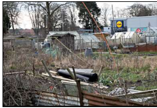
DSCF8874 ISO 400 X-T3 1/500 sec at