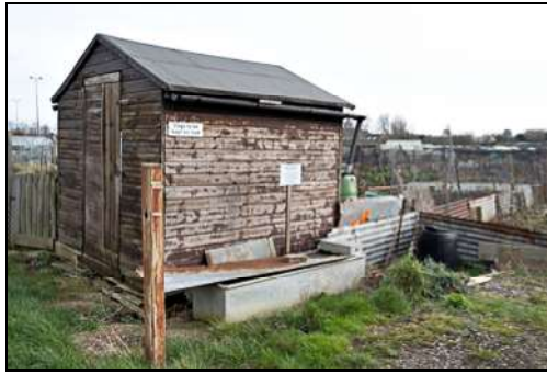
DSCF8731 ISO 160 X-T3 1/25 sec at f / 13