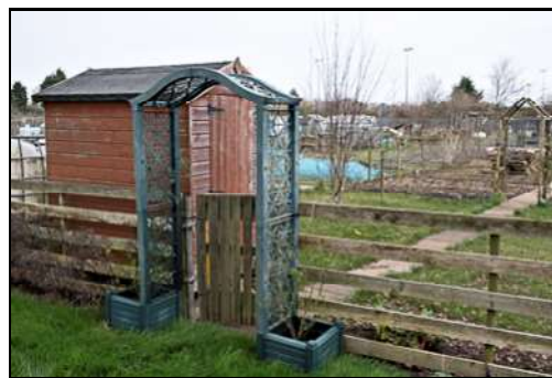
DSCF8756 ISO 400 X-T3 1/200 sec at f / 8.0