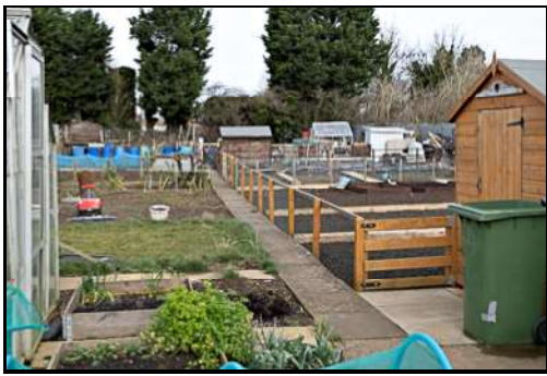
DSCF8869 ISO 400 X-T3 1/400 sec at