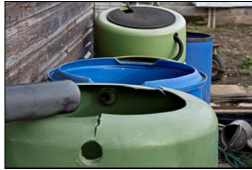
DSCF8732 ISO 160 X-T3 1/80 sec at f / 8.0