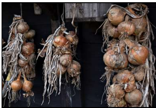
DSCF8830 ISO 500 X-T3 1/100 sec at f / 5.6