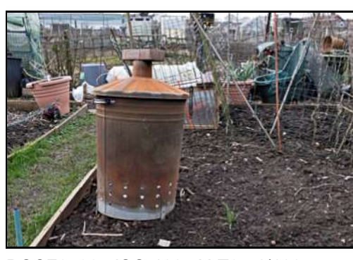
DSCF8798 ISO 400 X-T3 1/100 sec at f / 6.4