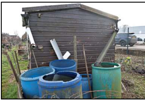
DSCF8742 ISO 400 X-T3 1/80 sec at f / 8.0