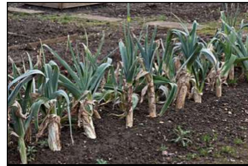
DSCF8765 ISO 400 X-T3 1/100 sec at f / 8.0