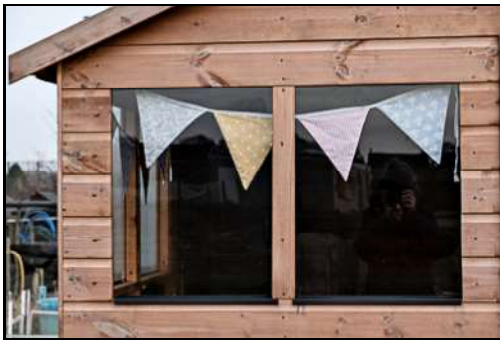
DSCF8808 ISO 400 X-T3 1/250 sec at f / 6.4 OR 8806