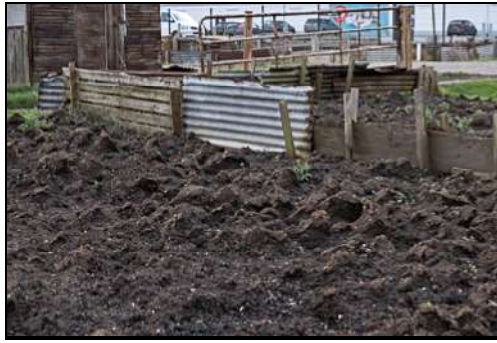
DSCF8836 ISO 500 X-T3 1/200 sec at