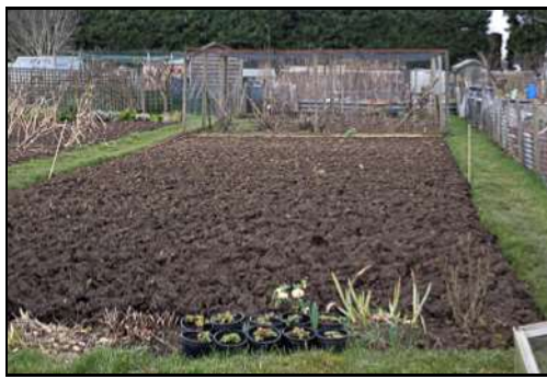
DSCF8773 ISO 400 X-T3 1/100 sec at f / 8.0