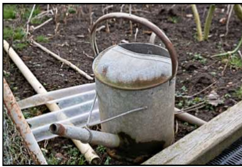
DSCF8803 ISO 400 X-T3 1/125 sec at f / 6.4