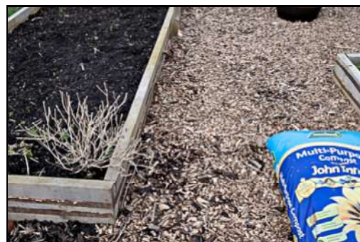
DSCF8816 ISO 400 X-T3 1/125 sec at f / 6.4