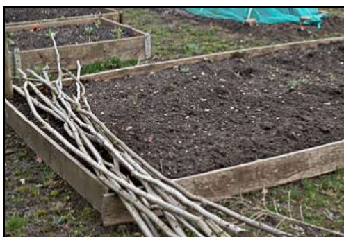
DSCF8767 ISO 400 X-T3 1/100 sec at f / 8.0