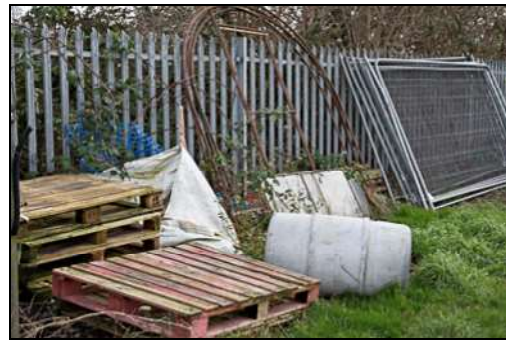
DSCF8780 ISO 400 X-T3 1/100 sec at f / 8.0