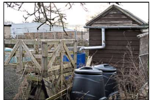
DSCF8843 ISO 500 X-T3 1/160 sec at