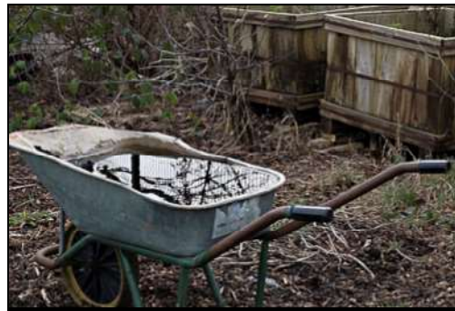
DSCF8750 ISO 400 X-T3 1/160 sec at f / 8.0