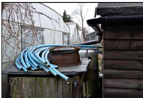
DSCF8785 ISO 400 X-T3 1/100 sec at f / 6.4