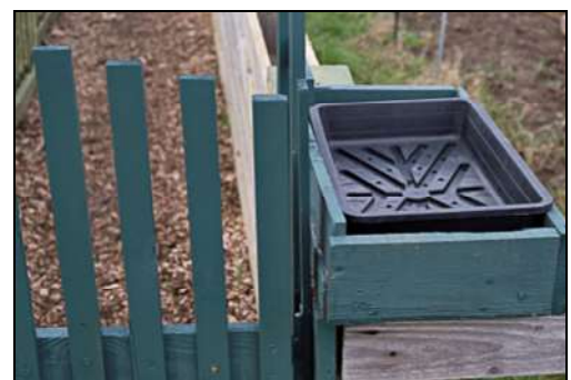
DSCF8846 ISO 500 X-T3 1/160 sec at