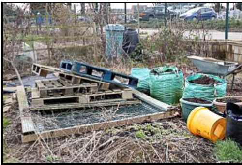
DSCF8748 ISO 400 X-T3 1/80 sec at f / 8.0