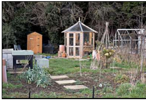
DSCF8849 ISO 500 X-T3 1/160 sec at