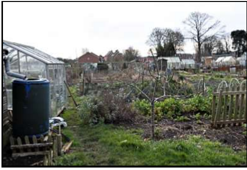
DSCF8875 ISO 400 X-T3 1/500 sec at