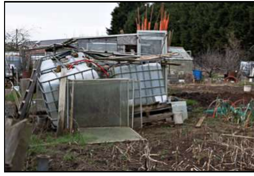
DSCF8801 ISO 400 X-T3 1/200 sec at f / 6.4