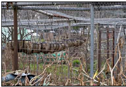
DSCF8788 ISO 400 X-T3 1/125 sec at f / 6.4