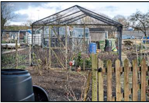
DSCF8864 ISO 160 X-T3 1/400 sec at