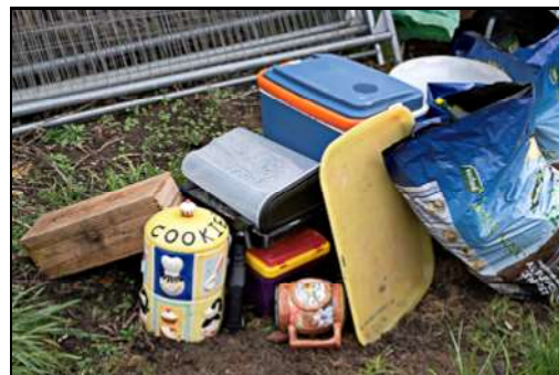
DSCF8783 ISO 400 X-T3 1/80 sec at f / 8.0