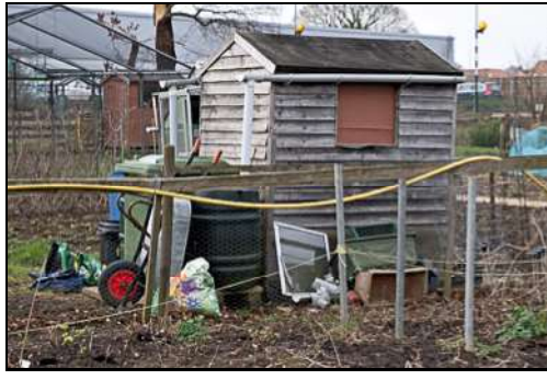
DSCF8791 ISO 400 X-T3 1/200 sec at f / 6.4