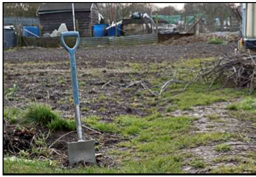
DSCF8873 ISO 400 X-T3 1/400 sec at