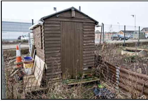
DSCF8745 ISO 400 X-T3 1/160 sec at f / 8.0