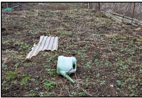
DSCF8802 ISO 400 X-T3 1/125 sec at f / 6.4