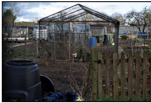
DSCF8865 ISO 160 X-T3 1/160 sec at