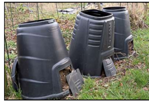
DSCF8759 ISO 400 X-T3 1/50 sec at f / 8.0