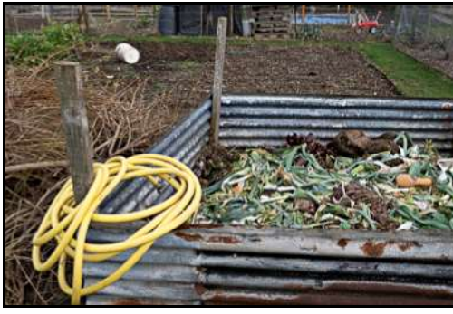
DSCF8799 ISO 400 X-T3 1/200 sec at f / 6.4