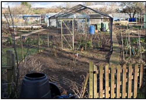
DSCF8866 ISO 160 X-T3 1/125 sec at