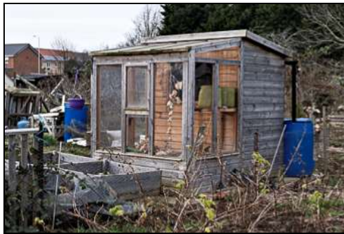
DSCF8809 ISO 400 X-T3 1/160 sec at f / 6.4