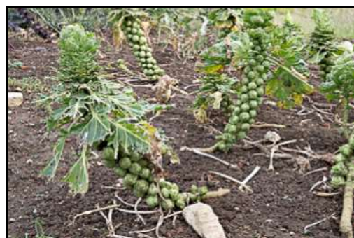
DSCF8741 ISO 400 X-T3 1/80 sec at f / 8.0