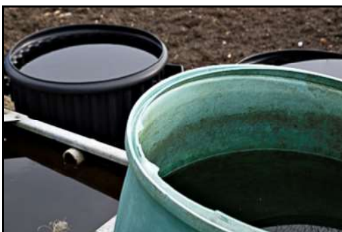
DSCF8736 ISO 400 X-T3 1/125 sec at f / 8.0