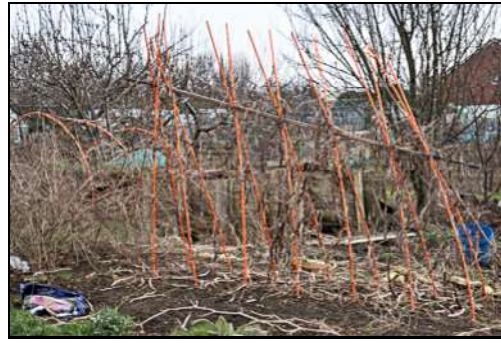
DSCF8747 ISO 400 X-T3 1/200 sec at f / 8.0