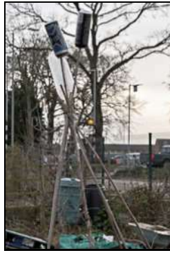
DSCF8746 ISO 400 X-T3 1/800 sec at f / 8.0