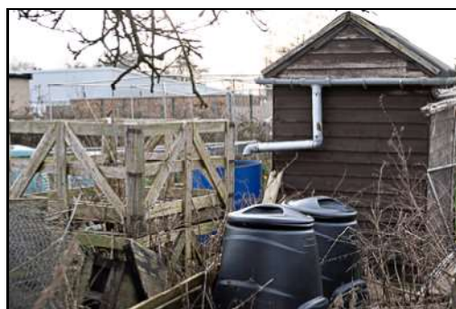
DSCF8844 ISO 500 X-T3 1/160 sec at