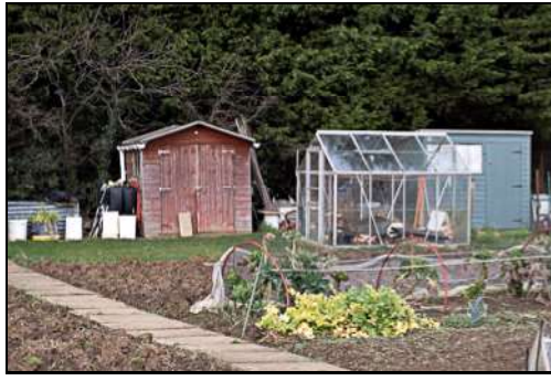
DSCF8821 ISO 400 X-T3 1/160 sec at f / 6.4