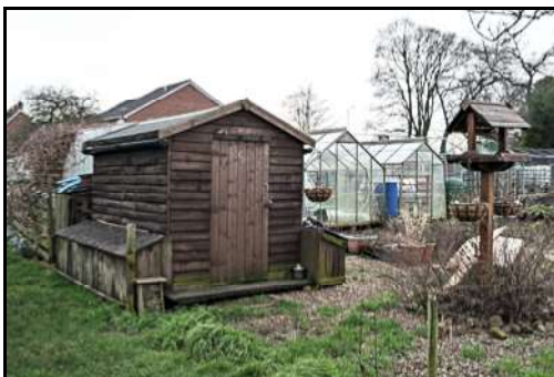
DSCF8781 ISO 400 X-T3 1/160 sec at f / 8.0