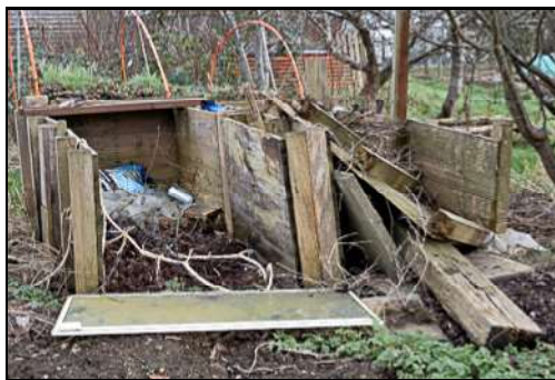
DSCF8752 ISO 400 X-T3 1/80 sec at f / 8.0