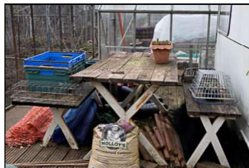
DSCF8786 ISO 400 X-T3 1/125 sec at f / 6.4