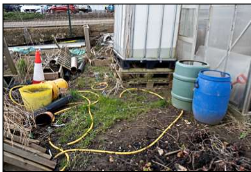
DSCF8885 ISO 400 X-T3 1/160 sec at