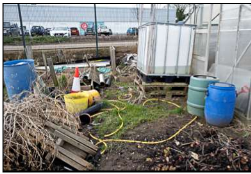
DSCF8888 ISO 400 X-T3 1/160 sec at