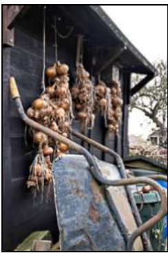
DSCF8826 ISO 500 X-T3 1/100 sec at f / 5.6