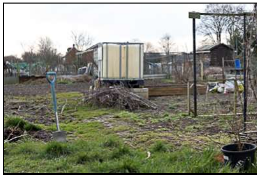
DSCF8871 ISO 400 X-T3 1/400 sec at