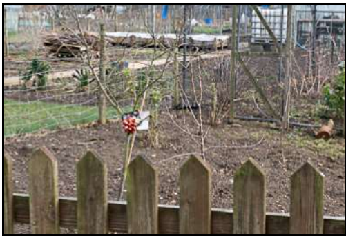
DSCF8881 ISO 400 X-T3 1/400 sec at