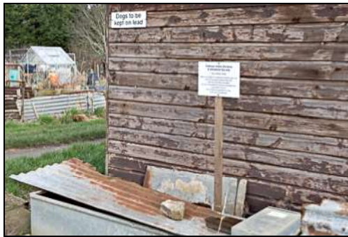
DSCF8734 ISO 160 X-T3 1/50 sec at f / 8.0