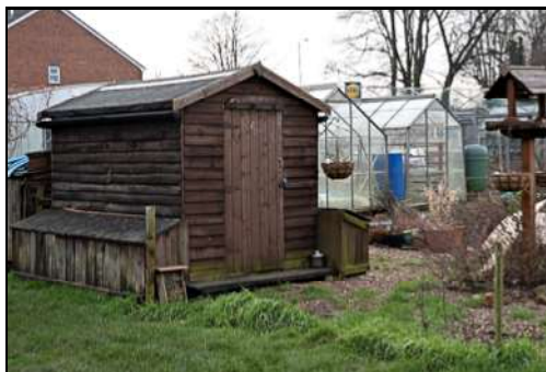
DSCF8782 ISO 400 X-T3 1/80 sec at f / 8.0