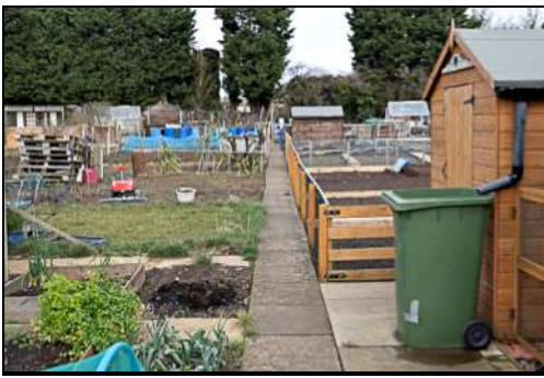
DSCF8870 ISO 400 X-T3 1/400 sec at