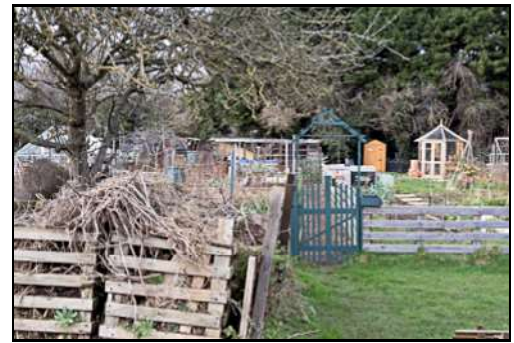
DSCF8840 ISO 500 X-T3 1/100 sec at