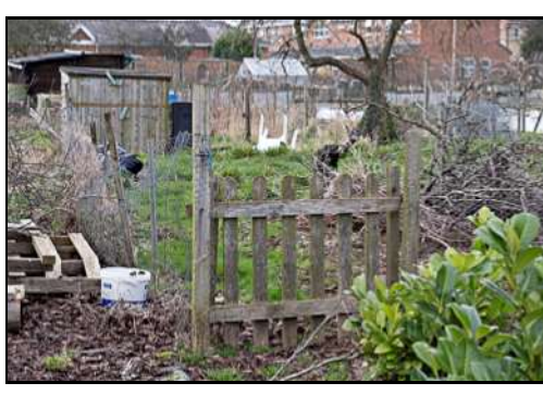
DSCF8812 ISO 400 X-T3 1/160 sec at f / 6.4