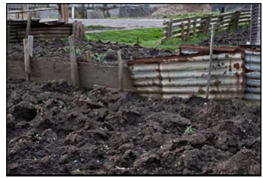
DSCF8834 ISO 500 X-T3 1/200 sec at