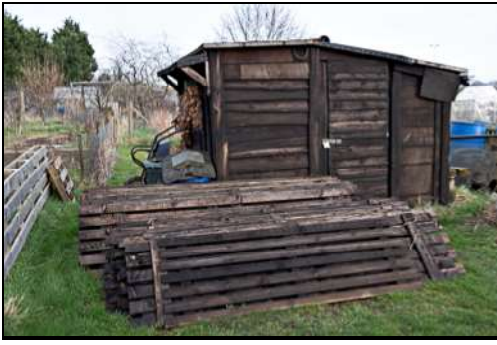
DSCF8851 ISO 500 X-T3 1/160 sec at