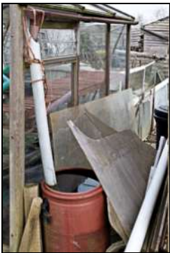
DSCF8811 ISO 400 X-T3 1/160 sec at f / 6.4