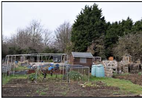
DSCF8839 ISO 500 X-T3 1/250 sec at