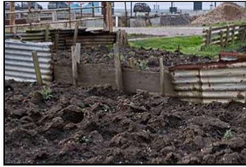
DSCF8835 ISO 500 X-T3 1/200 sec at