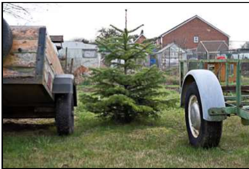
DSCF8778 ISO 400 X-T3 1/125 sec at f / 8.0