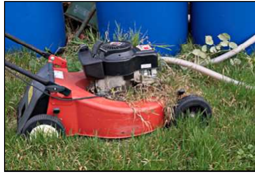
DSCF8792 ISO 400 X-T3 1/100 sec at f / 6.4