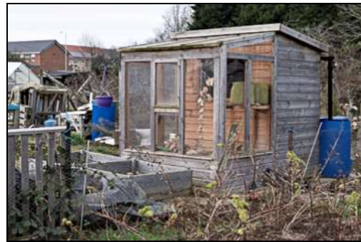
DSCF8810 ISO 400 X-T3 1/160 sec at f / 6.4