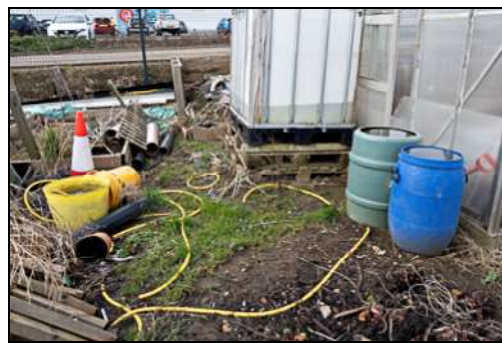
DSCF8886 ISO 400 X-T3 1/160 sec at