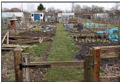
DSCF8755 ISO 400 X-T3 1/125 sec at f / 8.0