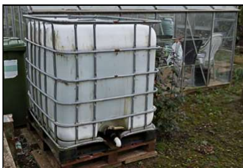
DSCF8770 ISO 400 X-T3 1/160 sec at f / 8.0