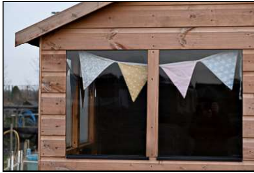
DSCF8806 ISO 400 X-T3 1/250 sec at f / 6.4