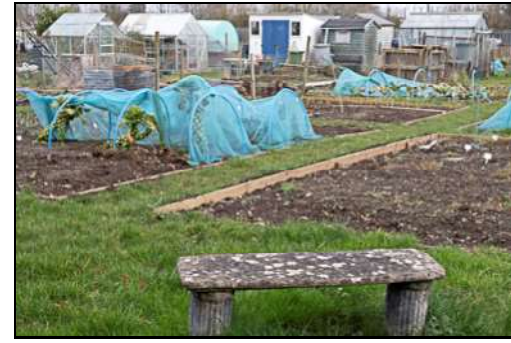
DSCF8762 ISO 400 X-T3 1/80 sec at f / 8.0