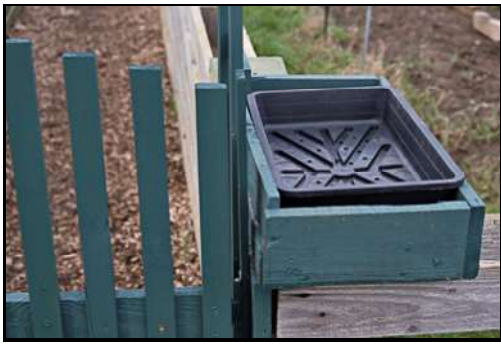
DSCF8847 ISO 500 X-T3 1/160 sec at