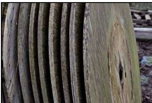
DSCF8814 ISO 400 X-T3 1/125 sec at f / 6.4