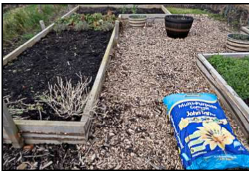
DSCF8817 ISO 400 X-T3 1/125 sec at f / 6.4