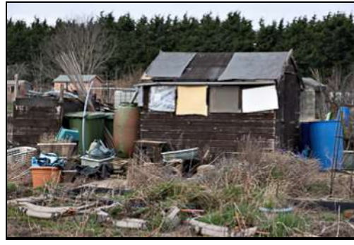
DSCF8795 ISO 400 X-T3 1/200 sec at f / 6.4