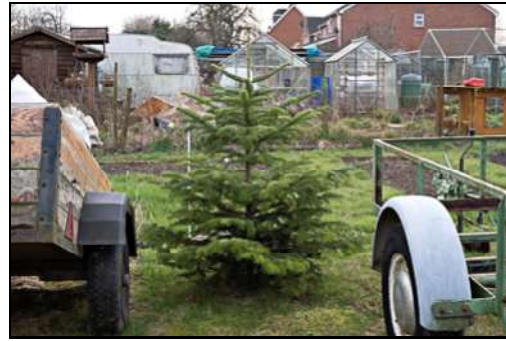
DSCF8777 ISO 400 X-T3 1/80 sec at f / 8.0