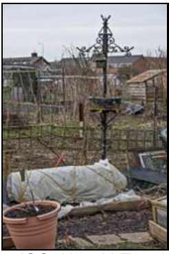
DSCF8796 ISO 400 X-T3 1/320 sec at f / 6.4