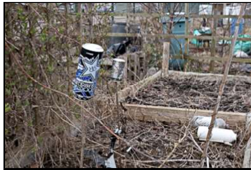
DSCF8763 ISO 400 X-T3 1/100 sec at f / 8.0