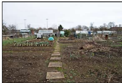
DSCF8753 ISO 400 X-T3 1/200 sec at f / 8.0