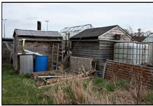
DSCF8743 ISO 400 X-T3 1/250 sec at f / 8.0