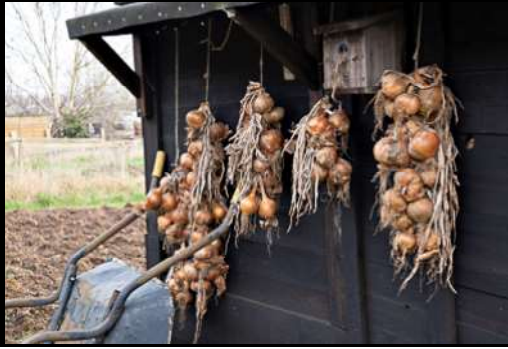
DSCF8829 ISO 500 X-T3 1/100 sec at f / 5.6