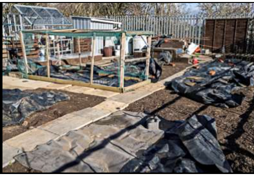
DSCF8978 ISO 400 X-T3 1/800 sec at f / 8.0