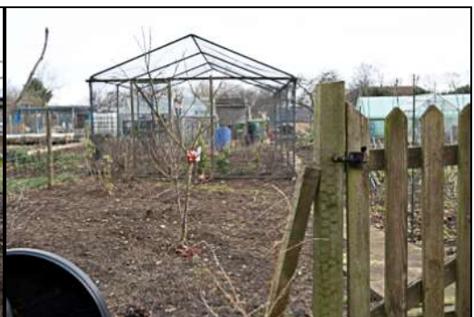
DSCF8879 ISO 400 X-T3 1/400 sec at f / 8.0