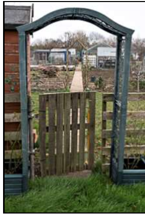
DSCF8761 ISO 400 X-T3 1/100 sec at f / 8.0