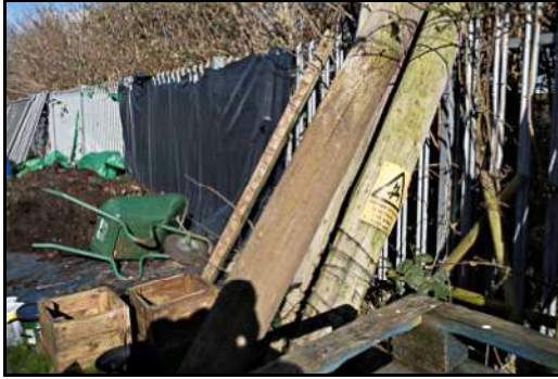
DSCF8992 ISO 400 X-T3 1/500 sec at f / 10