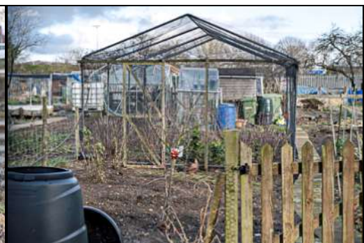
DSCF8864 ISO 160 X-T3 1/400 sec at f / 5.6