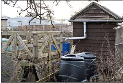
DSCF8843 ISO 500 X-T3 1/160 sec at f / 5.6