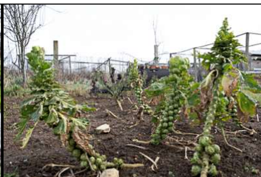
DSCF8878 ISO 400 X-T3 1/200 sec at f / 8.0