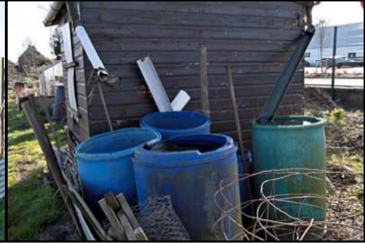
DSCF9008 ISO 400 X-T3 1/100 sec at f / 10