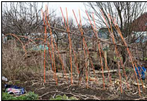
DSCF8747-Edit ISO 400 X-T3 1/200 sec at f / 8.0