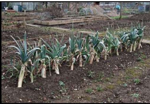
DSCF8764 ISO 400 X-T3 1/100 sec at f / 8.0