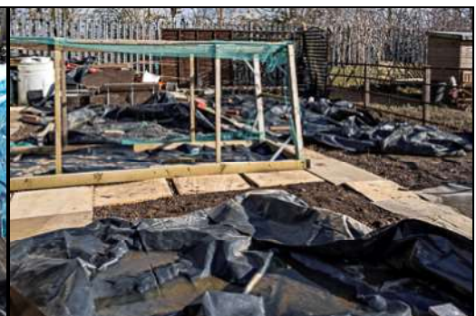
DSCF8976 ISO 400 X-T3 1/800 sec at f / 8.0