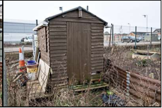
DSCF8745 ISO 400 X-T3 1/160 sec at f / 8.0