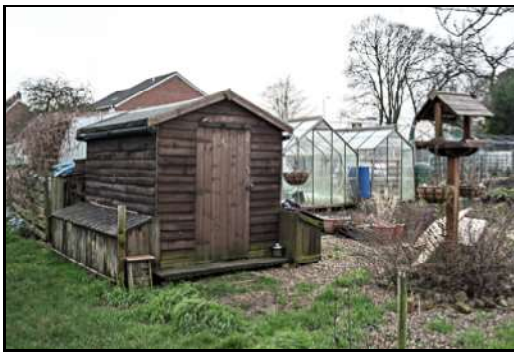
DSCF8781 ISO 400 X-T3 1/160 sec at f / 8.0