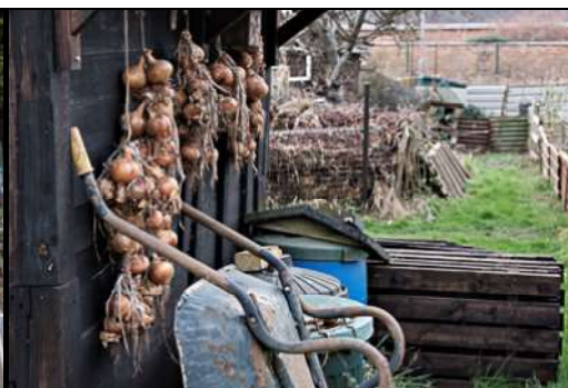
DSCF8824-Edit ISO 400 X-T3 1/60 sec at f / 6.4