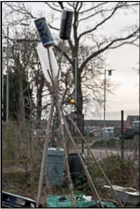
DSCF8746 ISO 400 X-T3 1/800 sec at f / 8.0