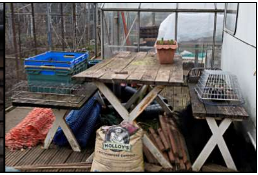
DSCF8786 ISO 400 X-T3 1/125 sec at f / 6.4