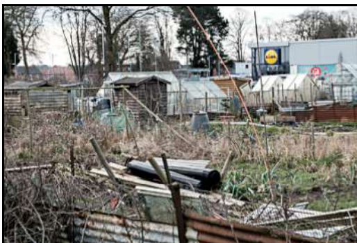
DSCF8874 ISO 400 X-T3 1/500 sec at f / 5.6