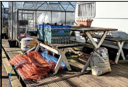
DSCF8995 ISO 400 X-T3 1/320 sec at f / 10