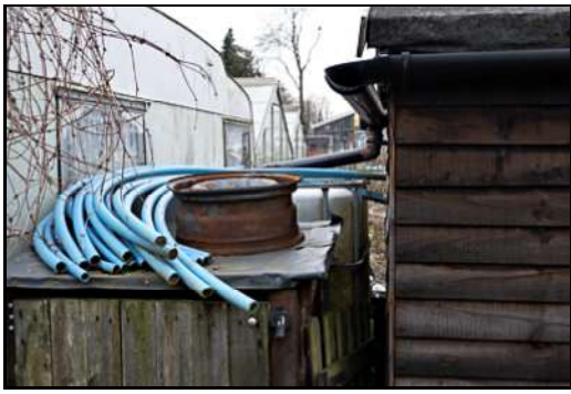
DSCF8784 ISO 400 X-T3 1/60 sec at f / 8.0