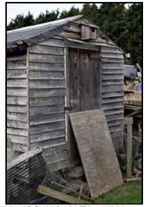
DSCF8800 ISO 400 X-T3 1/200 sec at f / 6.4