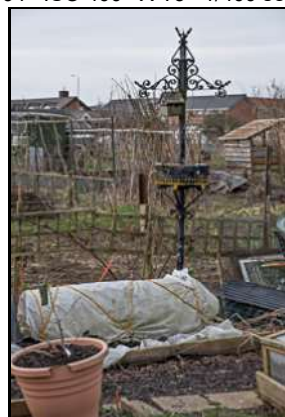
DSCF8796 ISO 400 X-T3 1/320 sec at f / 6.4