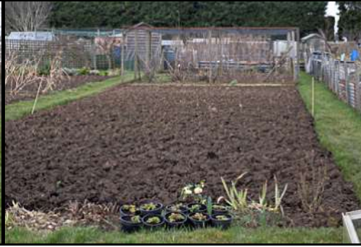
DSCF8773 ISO 400 X-T3 1/100 sec at f / 8.0