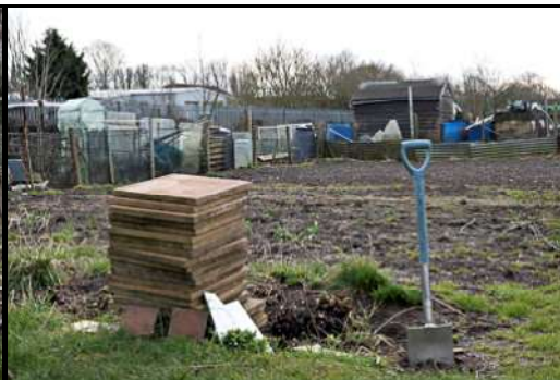
DSCF8872 ISO 400 X-T3 1/400 sec at f / 5.6