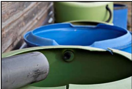
DSCF8735 ISO 400 X-T3 1/125 sec at f / 8.0