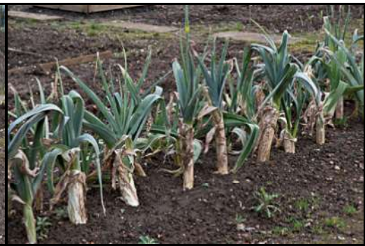
DSCF8765 ISO 400 X-T3 1/100 sec at f / 8.0