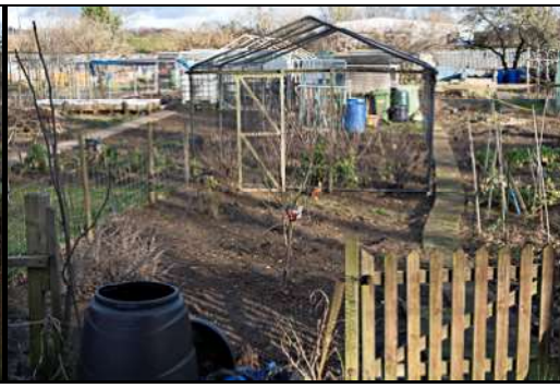
DSCF8866 ISO 160 X-T3 1/125 sec at f / 5.6