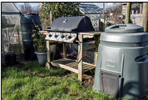
DSCF8997 ISO 400 X-T3 1/320 sec at f / 10