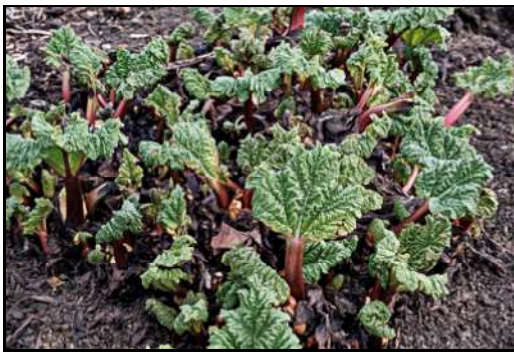
DSCF8751 ISO 400 X-T3 1/60 sec at f / 8.0