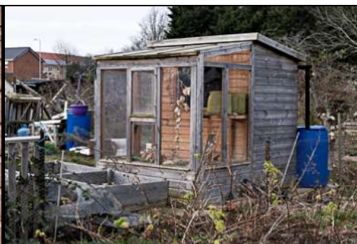
DSCF8809 ISO 400 X-T3 1/160 sec at f / 6.4