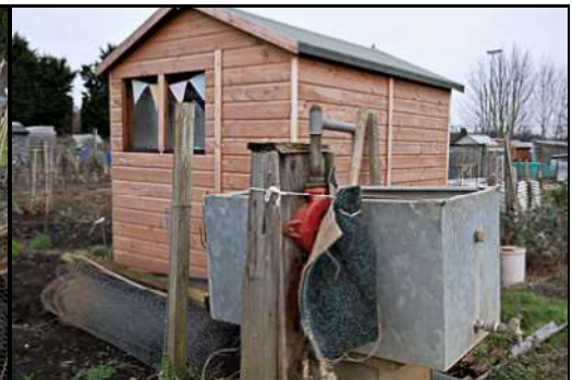
DSCF8805 ISO 400 X-T3 1/200 sec at f / 6.4