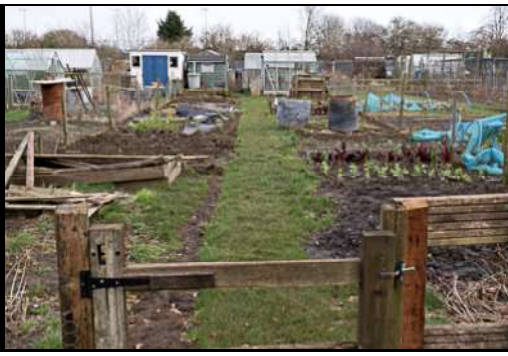
DSCF8755 ISO 400 X-T3 1/125 sec at f / 8.0