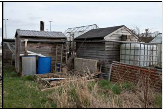
DSCF8743 ISO 400 X-T3 1/250 sec at f / 8.0