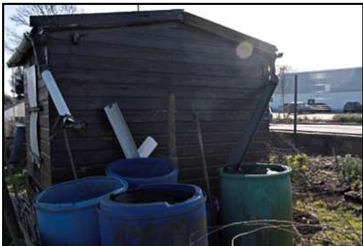
DSCF9011 ISO 400 X-T3 1/250 sec at f / 10