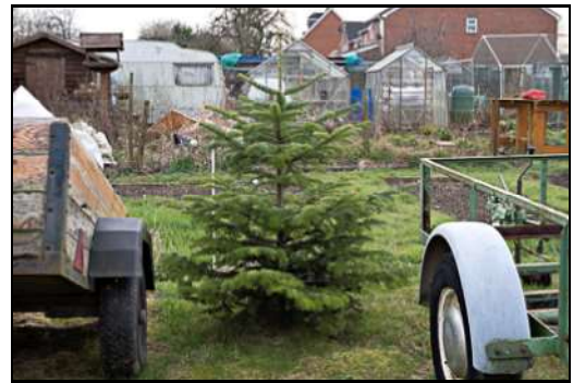
DSCF8777 ISO 400 X-T3 1/80 sec at f / 8.0