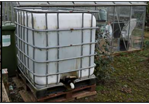
DSCF8770 ISO 400 X-T3 1/160 sec at f / 8.0