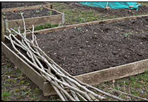
DSCF8767 ISO 400 X-T3 1/100 sec at f / 8.0