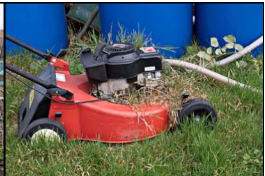
DSCF8792 ISO 400 X-T3 1/100 sec at f / 6.4