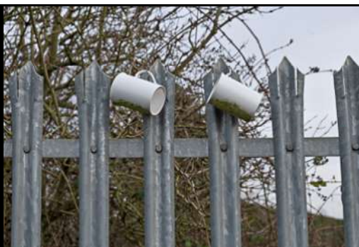
DSCF8794 ISO 400 X-T3 1/400 sec at f / 6.4