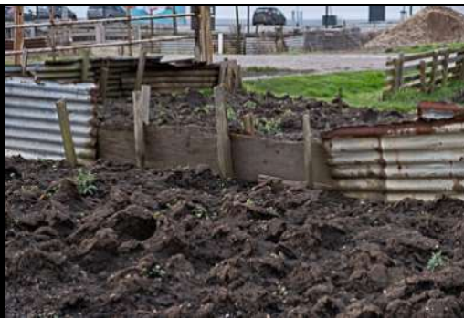
DSCF8835 ISO 500 X-T3 1/200 sec at f / 5.6