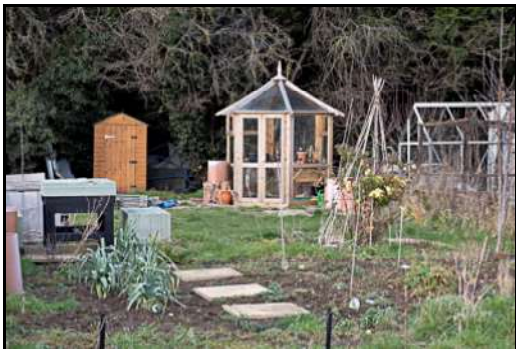
DSCF8849 ISO 500 X-T3 1/160 sec at f / 5.6