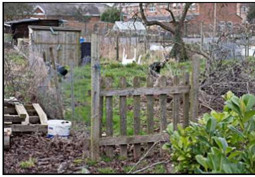
DSCF8812 ISO 400 X-T3 1/160 sec at f / 6.4