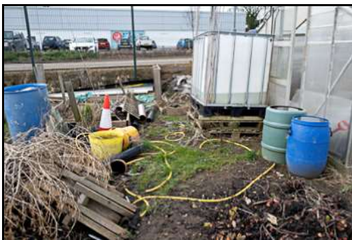
DSCF8888 ISO 400 X-T3 1/160 sec at f / 8.0