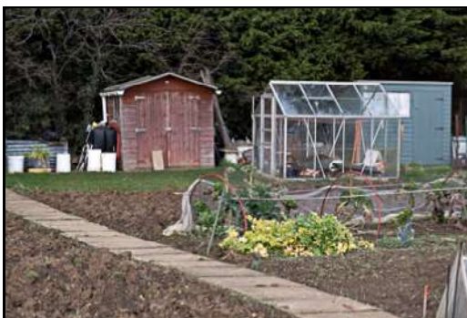
DSCF8823 ISO 400 X-T3 1/125 sec at f / 6.4