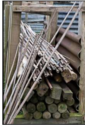
DSCF8776 ISO 400 X-T3 1/60 sec at f / 8.0