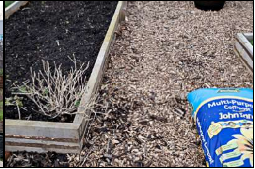
DSCF8816 ISO 400 X-T3 1/125 sec at f / 6.4