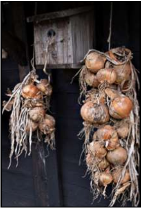
DSCF8831 ISO 500 X-T3 1/100 sec at f / 5.6