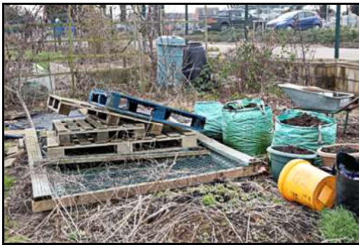
DSCF8748 ISO 400 X-T3 1/80 sec at f / 8.0