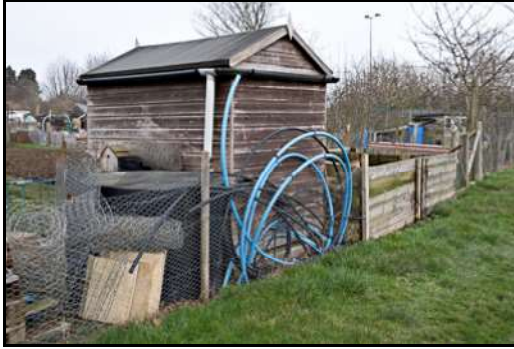
DSCF8772 ISO 400 X-T3 1/100 sec at f / 8.0