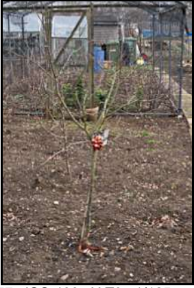
DSCF8757 ISO 400 X-T3 1/125 sec at f / 8.0