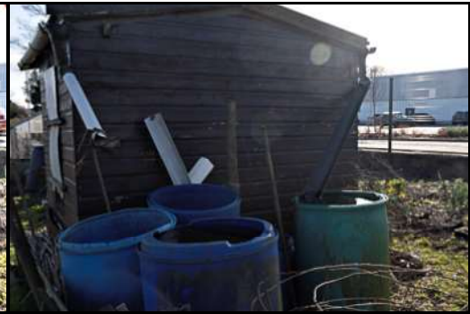
DSCF9010 ISO 400 X-T3 1/250 sec at f / 10