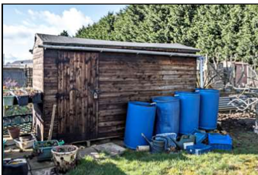
DSCF8974 ISO 400 X-T3 1/200 sec at f / 8.0