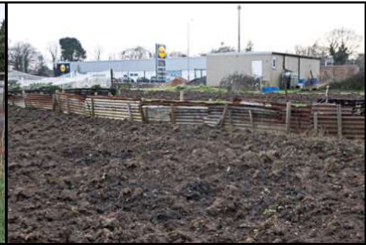
DSCF8833 ISO 500 X-T3 1/160 sec at f / 5.6