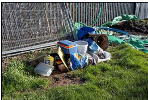
DSCF8987 ISO 400 X-T3 1/320 sec at f / 10