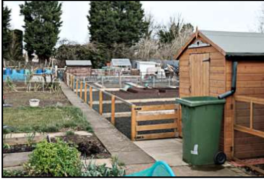
DSCF8868 ISO 400 X-T3 1/400 sec at f / 5.6