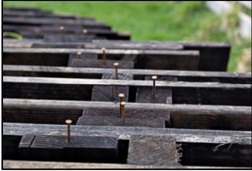
DSCF8828 ISO 500 X-T3 1/100 sec at f / 5.6