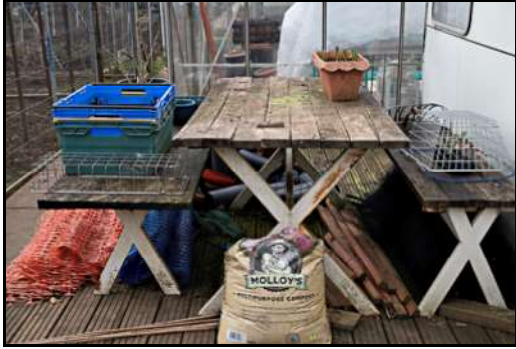
DSCF8787 ISO 400 X-T3 1/125 sec at f / 6.4