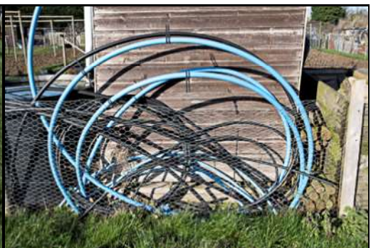
DSCF8999 ISO 400 X-T3 1/320 sec at f / 10