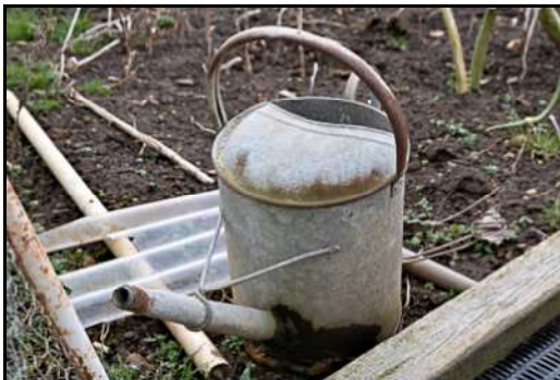
DSCF8803 ISO 400 X-T3 1/125 sec at f / 6.4