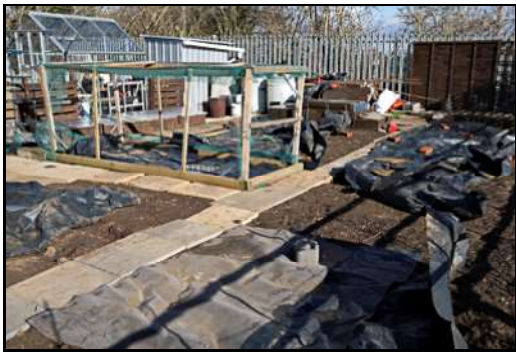
DSCF8977 ISO 400 X-T3 1/800 sec at f / 8.0