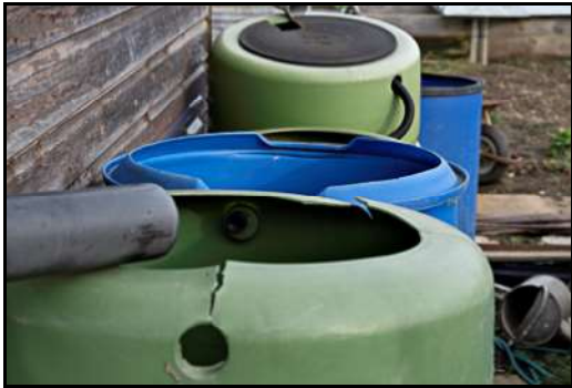
DSCF8732 ISO 160 X-T3 1/80 sec at f / 8.0