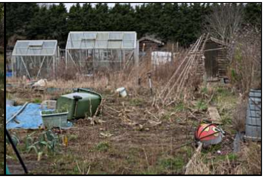
DSCF8771 ISO 400 X-T3 1/160 sec at f / 8.0