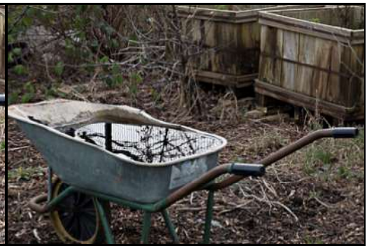
DSCF8750 ISO 400 X-T3 1/160 sec at f / 8.0