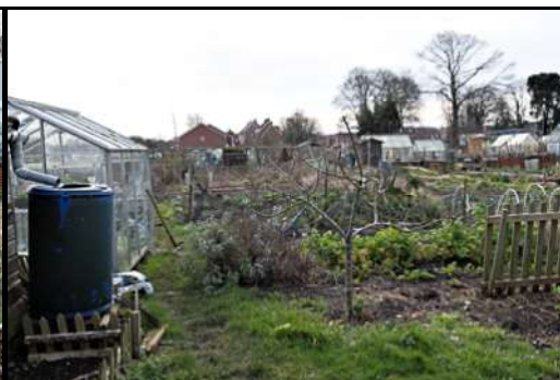
DSCF8875 ISO 400 X-T3 1/500 sec at f / 5.6