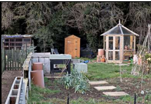
DSCF8850 ISO 500 X-T3 1/160 sec at f / 5.6