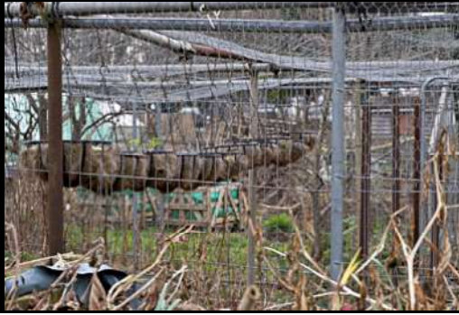
DSCF8788 ISO 400 X-T3 1/125 sec at f / 6.4