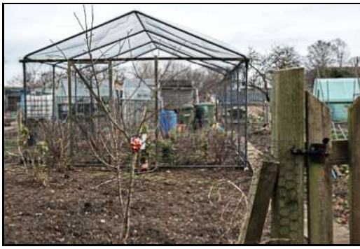
DSCF8880-Edit ISO 400 X-T3 1/400 sec at f / 8.0