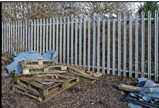
DSCF8986 ISO 400 X-T3 1/200 sec at f / 10