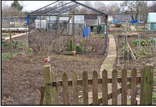
DSCF8758 ISO 400 X-T3 1/80 sec at f / 8.0