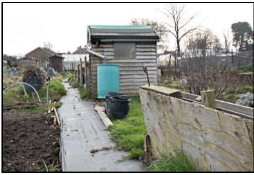
DSCF8727 ISO 160 X-T3 1/30 sec at f / 13