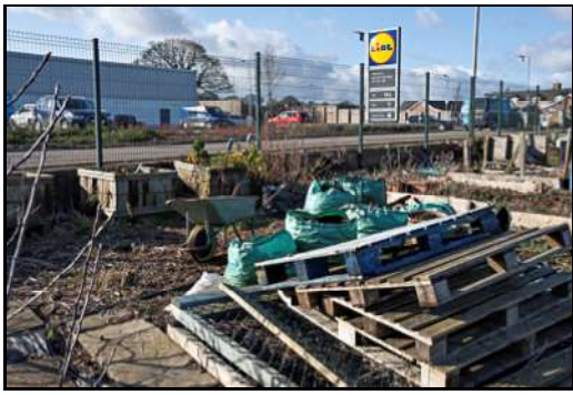
DSCF9003 ISO 400 X-T3 1/400 sec at f / 10