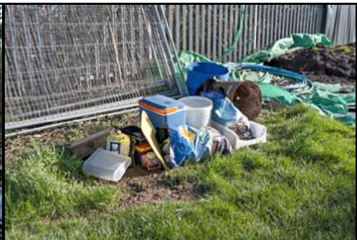
DSCF8987-Edit ISO 400 X-T3 1/320 sec at f / 10