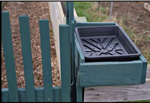
DSCF8847 ISO 500 X-T3 1/160 sec at f / 5.6