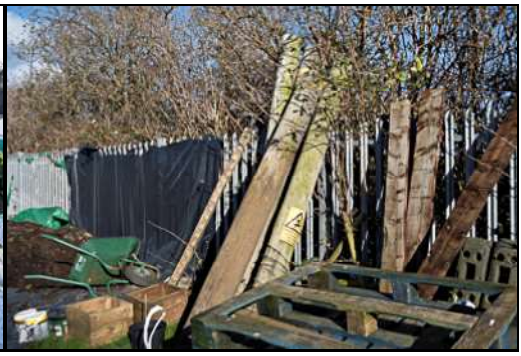
DSCF8991 ISO 400 X-T3 1/500 sec at f / 10