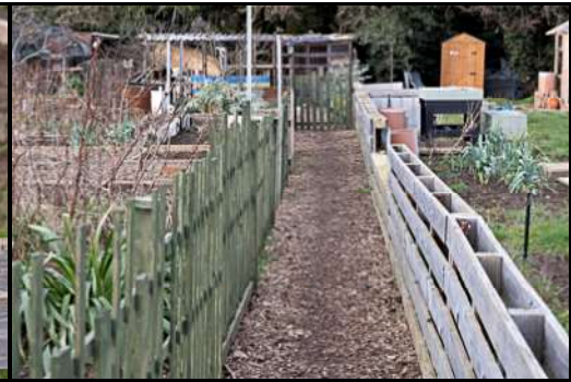
DSCF8848 ISO 500 X-T3 1/160 sec at f / 5.6