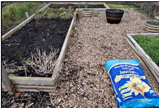
DSCF8817 ISO 400 X-T3 1/125 sec at f / 6.4