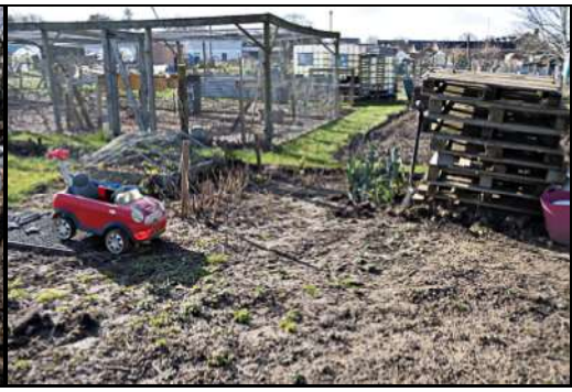
DSCF8979 ISO 400 X-T3 1/250 sec at f / 8.0