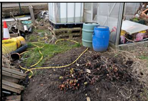
DSCF8889 ISO 400 X-T3 1/160 sec at f / 8.0