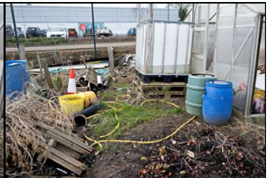
DSCF8887 ISO 400 X-T3 1/160 sec at f / 8.0