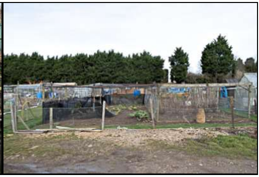
DSCF8867 ISO 400 X-T3 1/500 sec at f / 5.6