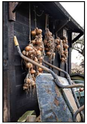
DSCF8827 ISO 500 X-T3 1/100 sec at f / 5.6