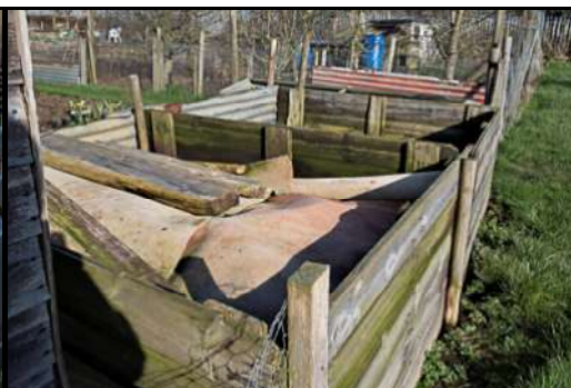
DSCF8998 ISO 400 X-T3 1/320 sec at f / 10