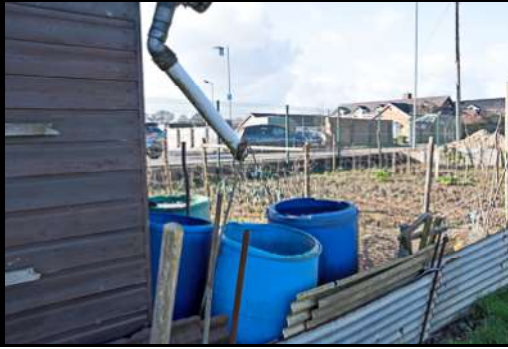
DSCF9007 ISO 400 X-T3 1/125 sec at f / 10