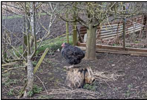
DSCF8775 ISO 400 X-T3 1/60 sec at f / 8.0