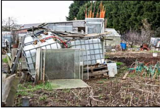
DSCF8801-Edit ISO 400 X-T3 1/200 sec at f / 6.4