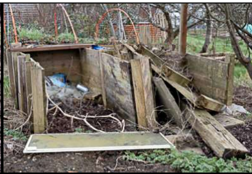
DSCF8752 ISO 400 X-T3 1/80 sec at f / 8.0