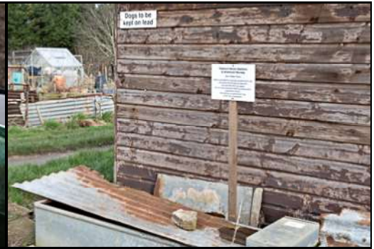
DSCF8734 ISO 160 X-T3 1/50 sec at f / 8.0