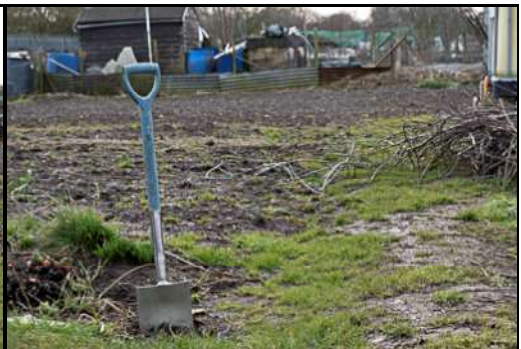
DSCF8873 ISO 400 X-T3 1/400 sec at f / 5.6