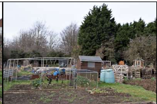
DSCF8839 ISO 500 X-T3 1/250 sec at f / 5.6