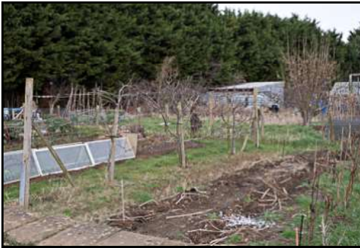
DSCF8832 ISO 500 X-T3 1/320 sec at f / 5.6