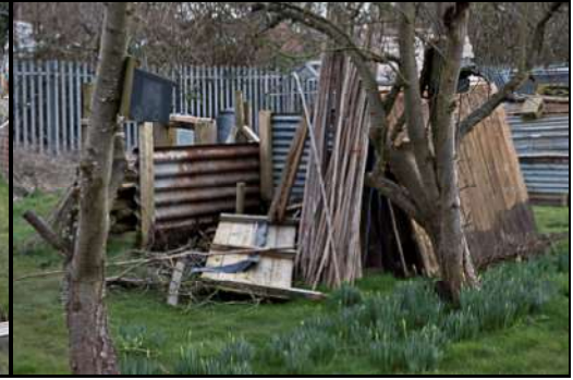
DSCF8774 ISO 400 X-T3 1/100 sec at f / 8.0