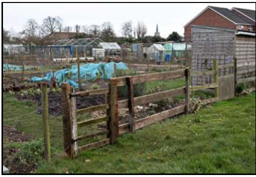
DSCF8754 ISO 400 X-T3 1/160 sec at f / 8.0