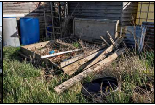
DSCF9005 ISO 400 X-T3 1/320 sec at f / 10