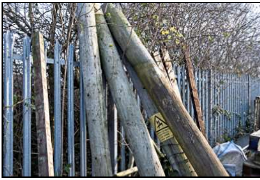
DSCF8989 ISO 400 X-T3 1/80 sec at f / 10