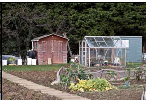
DSCF8821 ISO 400 X-T3 1/160 sec at f / 6.4