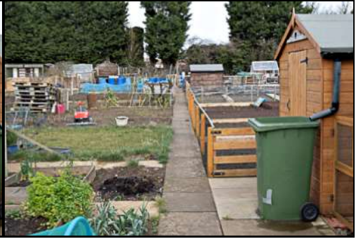
DSCF8870 ISO 400 X-T3 1/400 sec at f / 5.6