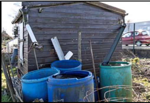
DSCF9009 ISO 400 X-T3 1/100 sec at f / 10