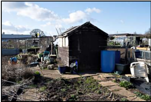
DSCF8983 ISO 400 X-T3 1/400 sec at f / 9.0