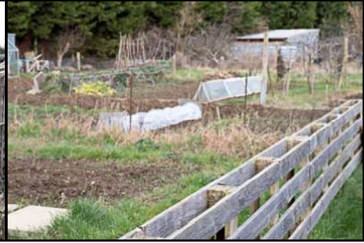
DSCF8845 ISO 500 X-T3 1/160 sec at f / 5.6