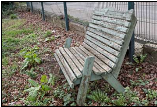
DSCF8760 ISO 400 X-T3 1/80 sec at f / 8.0