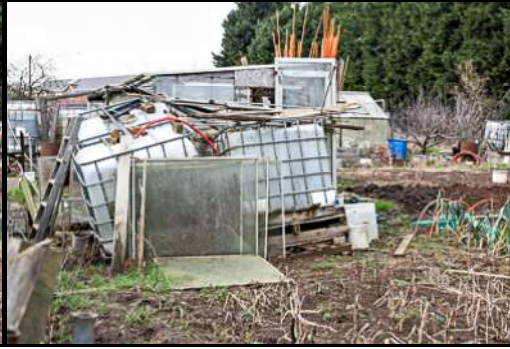
DSCF8801 ISO 400 X-T3 1/200 sec at f / 6.4