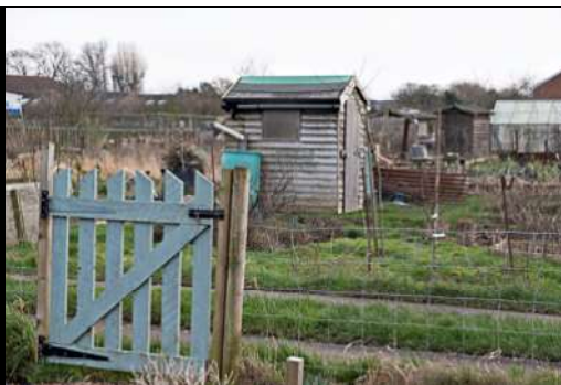
DSCF8838 ISO 500 X-T3 1/250 sec at f / 5.6