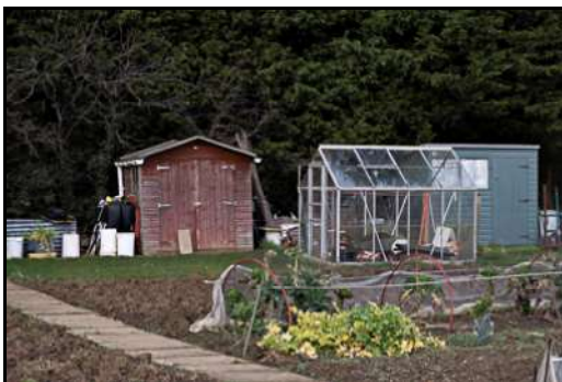
DSCF8820 ISO 400 X-T3 1/160 sec at f / 6.4