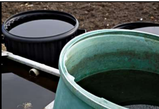
DSCF8736 ISO 400 X-T3 1/125 sec at f / 8.0