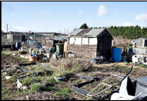
DSCF8984 ISO 400 X-T3 1/500 sec at f / 7.1