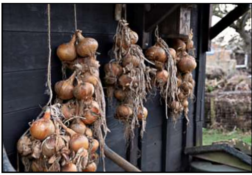
DSCF8825 ISO 400 X-T3 1/60 sec at f / 5.6