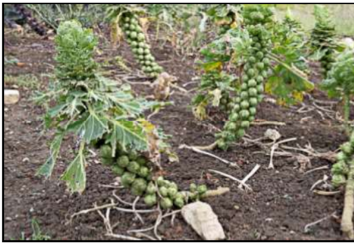
DSCF8741 ISO 400 X-T3 1/80 sec at f / 8.0