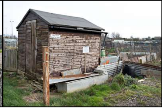
DSCF8731 ISO 160 X-T3 1/25 sec at f / 13