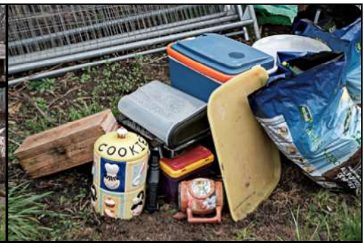
DSCF8783 ISO 400 X-T3 1/80 sec at f / 8.0