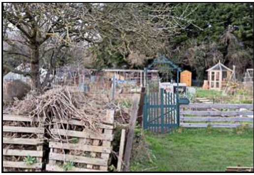
DSCF8840 ISO 500 X-T3 1/100 sec at f / 5.6