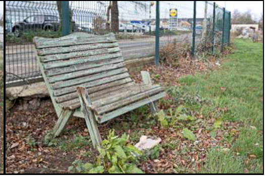
DSCF8884 ISO 400 X-T3 1/160 sec at f / 8.0