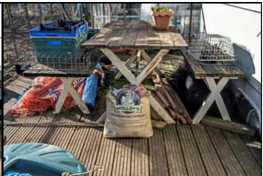
DSCF8996 ISO 400 X-T3 1/250 sec at f / 10