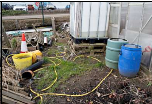
DSCF8886 ISO 400 X-T3 1/160 sec at f / 8.0