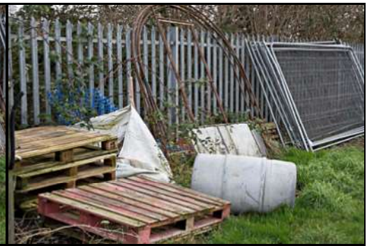
DSCF8780 ISO 400 X-T3 1/100 sec at f / 8.0