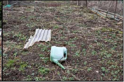
DSCF8802 ISO 400 X-T3 1/125 sec at f / 6.4