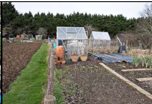
DSCF8818 ISO 400 X-T3 1/160 sec at f / 6.4