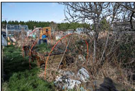
DSCF9000 ISO 400 X-T3 1/500 sec at f / 10