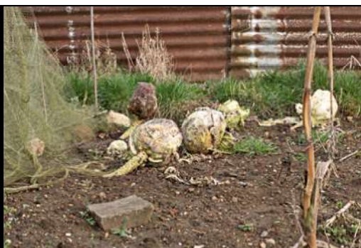
DSCF8739 ISO 400 X-T3 1/160 sec at f / 8.0