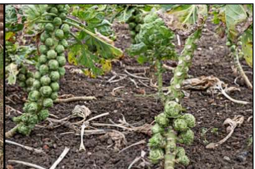
DSCF8740 ISO 400 X-T3 1/80 sec at f / 8.0