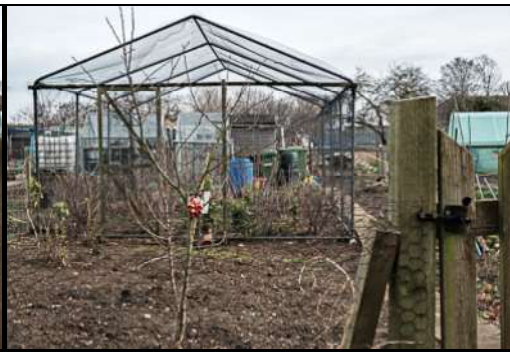
DSCF8880 ISO 400 X-T3 1/400 sec at f / 8.0