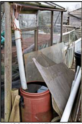
DSCF8811 ISO 400 X-T3 1/160 sec at f / 6.4