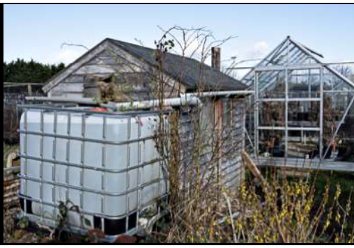
DSCF9004 ISO 400 X-T3 1/250 sec at f / 10