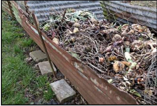
DSCF8729 ISO 160 X-T3 1/25 sec at f / 13