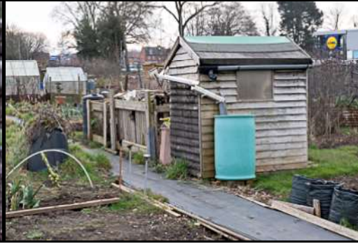
DSCF8815 ISO 400 X-T3 1/125 sec at f / 6.4