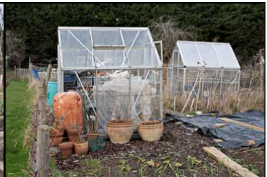
DSCF8819 ISO 400 X-T3 1/160 sec at f / 6.4