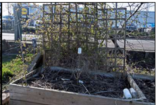
DSCF9002 ISO 400 X-T3 1/125 sec at f / 10