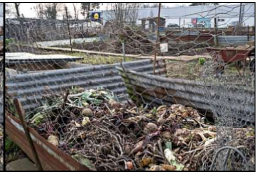
DSCF8728 ISO 160 X-T3 1/25 sec at f / 13