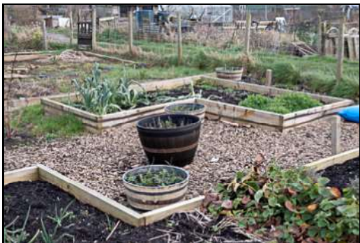
DSCF8837 ISO 500 X-T3 1/250 sec at f / 5.6