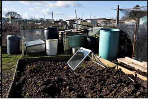
DSCF8982 ISO 400 X-T3 1/500 sec at f / 9.0