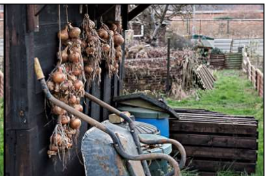
DSCF8824 ISO 400 X-T3 1/60 sec at f / 6.4