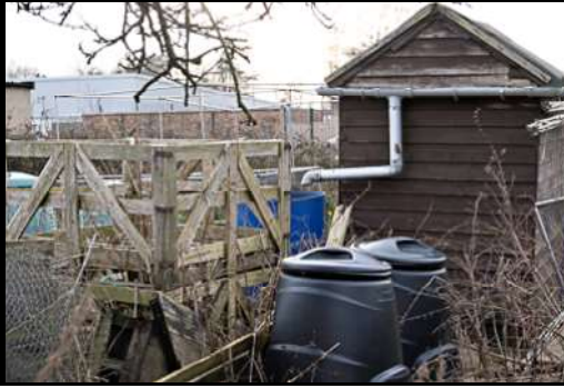
DSCF8844 ISO 500 X-T3 1/160 sec at f / 5.6