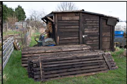
DSCF8851 ISO 500 X-T3 1/160 sec at f / 5.6