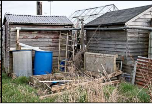
DSCF8744 ISO 400 X-T3 1/250 sec at f / 8.0