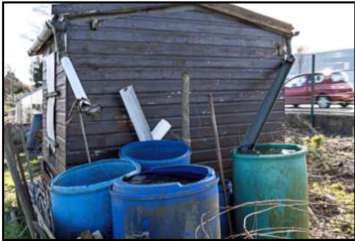
DSCF9009-Edit ISO 400 X-T3 1/100 sec at f / 10