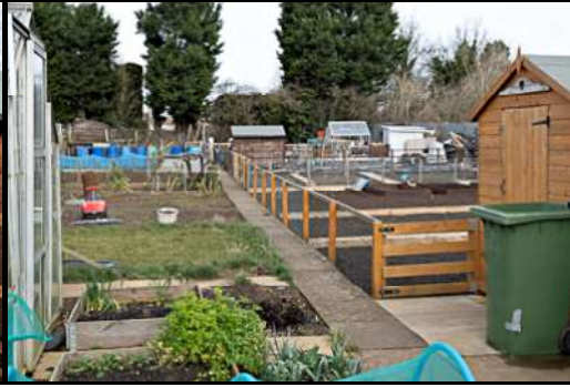
DSCF8869 ISO 400 X-T3 1/400 sec at f / 5.6