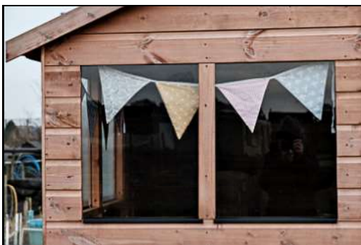
DSCF8808 ISO 400 X-T3 1/250 sec at f / 6.4