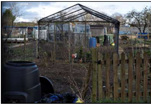
DSCF8865 ISO 160 X-T3 1/160 sec at f / 5.6