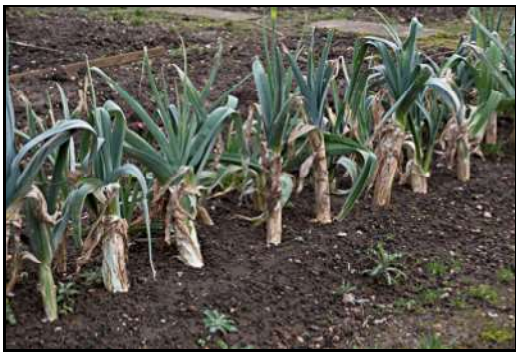
DSCF8766 ISO 400 X-T3 1/100 sec at f / 8.0