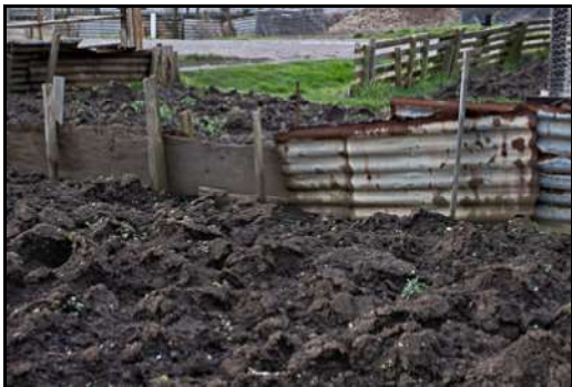
DSCF8834 ISO 500 X-T3 1/200 sec at f / 5.6