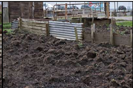
DSCF8836 ISO 500 X-T3 1/200 sec at f / 5.6