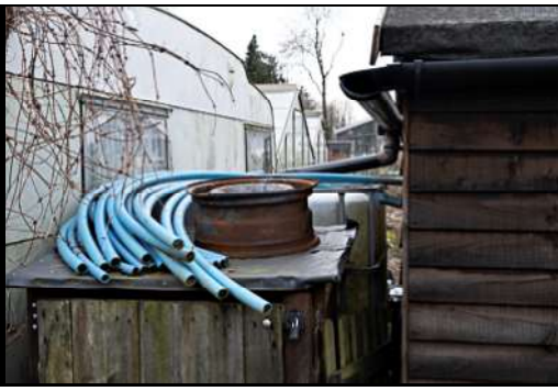
DSCF8785 ISO 400 X-T3 1/100 sec at f / 6.4