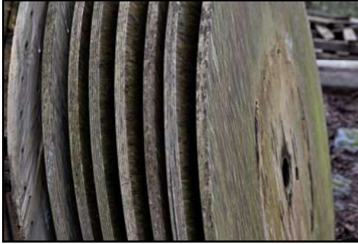
DSCF8814 ISO 400 X-T3 1/125 sec at f / 6.4