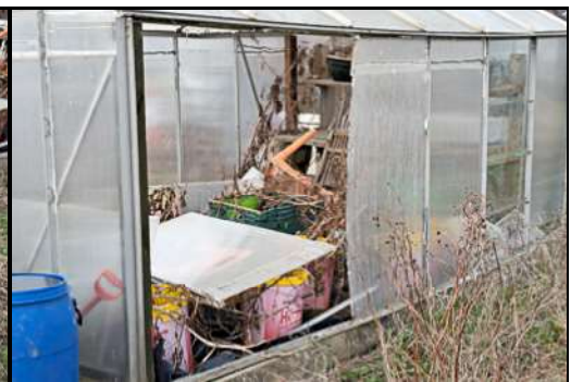
DSCF8890 ISO 400 X-T3 1/160 sec at f / 8.0