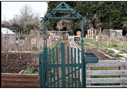
DSCF8841 ISO 500 X-T3 1/125 sec at f / 5.6