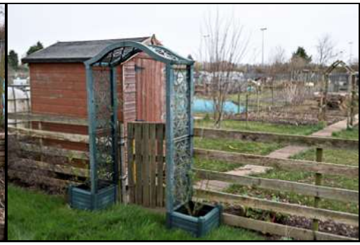
DSCF8756 ISO 400 X-T3 1/200 sec at f / 8.0