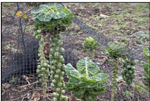
DSCF8738 ISO 400 X-T3 1/125 sec at f / 8.0