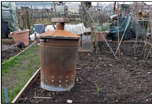
DSCF8798 ISO 400 X-T3 1/100 sec at f / 6.4