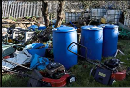
DSCF8993 ISO 400 X-T3 1/125 sec at f / 10