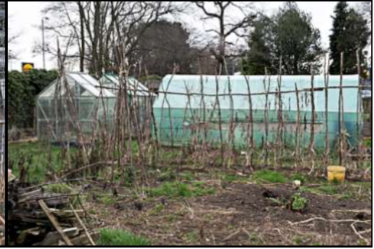
DSCF8789 ISO 400 X-T3 1/200 sec at f / 6.4