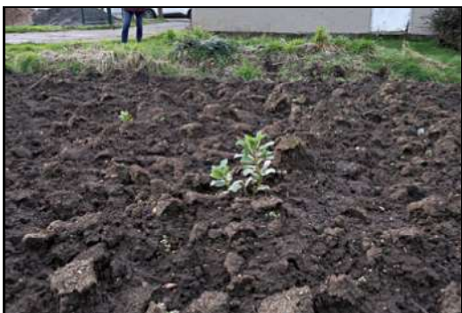
DSCF8852 ISO 500 X-T3 1/160 sec at f / 5.6