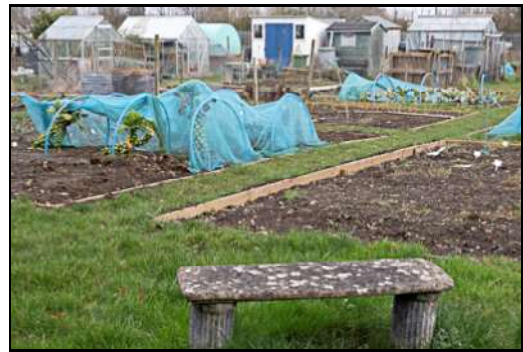
DSCF8762 ISO 400 X-T3 1/80 sec at f / 8.0