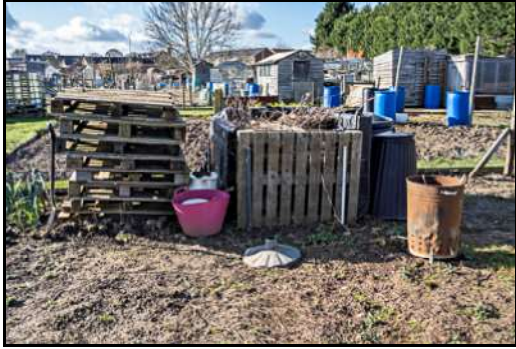
DSCF8980 ISO 400 X-T3 1/250 sec at f / 8.0