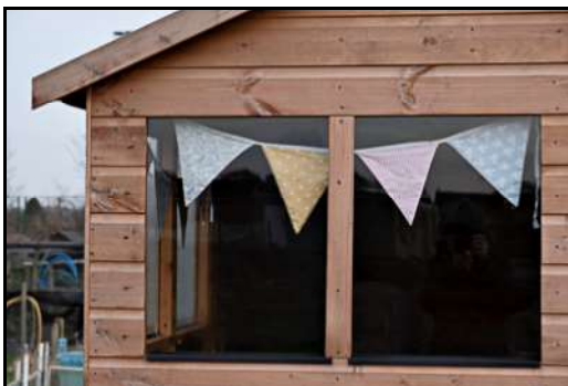
DSCF8806 ISO 400 X-T3 1/250 sec at f / 6.4