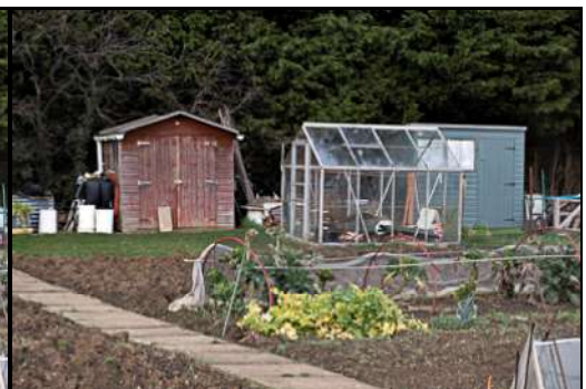
DSCF8822 ISO 400 X-T3 1/125 sec at f / 6.4