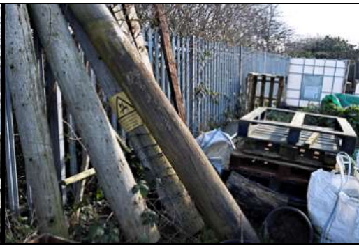
DSCF8990 ISO 400 X-T3 1/80 sec at f / 10