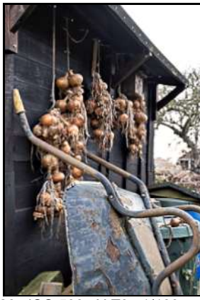
DSCF8826 ISO 500 X-T3 1/100 sec at f / 5.6