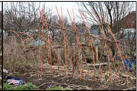
DSCF8747 ISO 400 X-T3 1/200 sec at f / 8.0