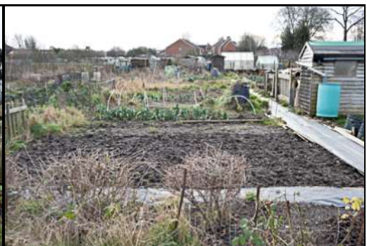
DSCF8876 ISO 400 X-T3 1/320 sec at f / 5.6