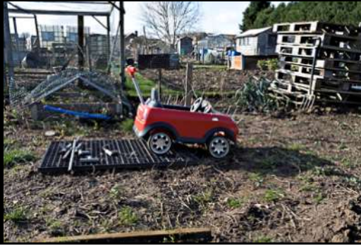
DSCF8981 ISO 400 X-T3 1/320 sec at f / 8.0