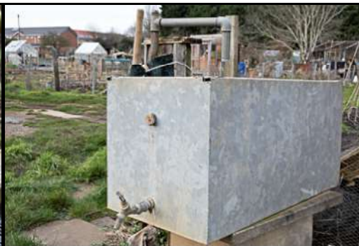
DSCF8804 ISO 400 X-T3 1/125 sec at f / 6.4