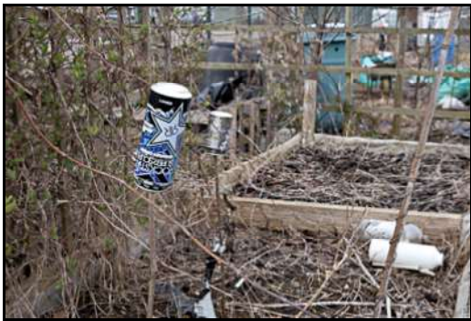
DSCF8763 ISO 400 X-T3 1/100 sec at f / 8.0