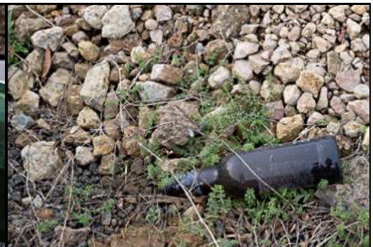
DSCF8737 ISO 400 X-T3 1/125 sec at f / 8.0