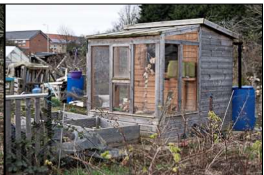
DSCF8810 ISO 400 X-T3 1/160 sec at f / 6.4