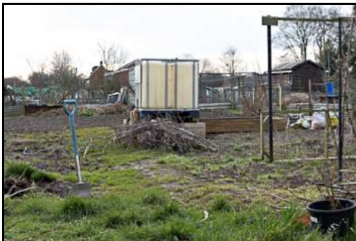
DSCF8871 ISO 400 X-T3 1/400 sec at f / 5.6