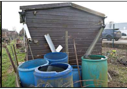
DSCF8742 ISO 400 X-T3 1/80 sec at f / 8.0