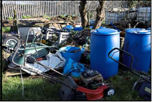
DSCF8994 ISO 400 X-T3 1/125 sec at f / 10