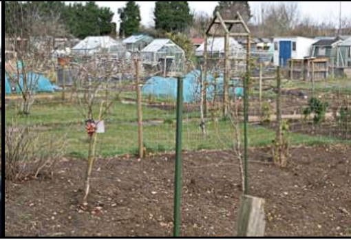
DSCF8883 ISO 400 X-T3 1/400 sec at f / 8.0