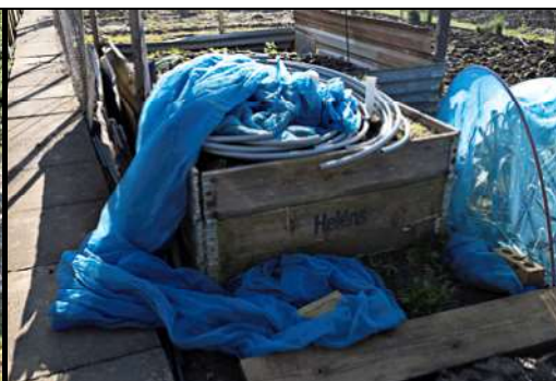
DSCF8975 ISO 400 X-T3 1/250 sec at f / 8.0