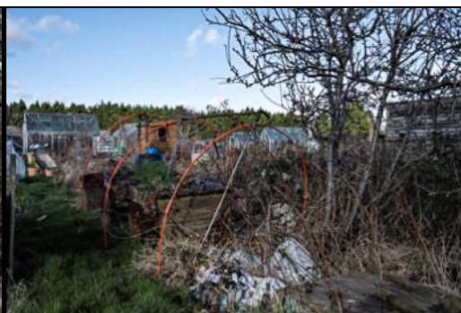
DSCF9001 ISO 400 X-T3 1/500 sec at f / 10