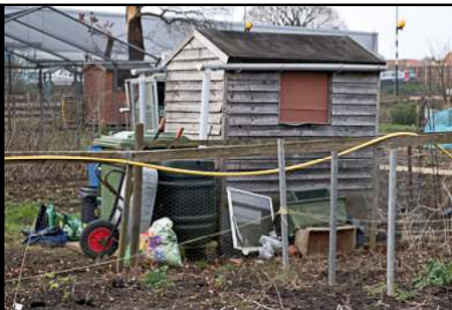
DSCF8791 ISO 400 X-T3 1/200 sec at f / 6.4