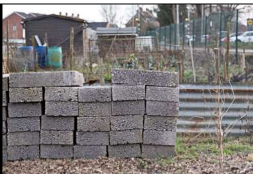
DSCF8853 ISO 500 X-T3 1/160 sec at f / 5.6