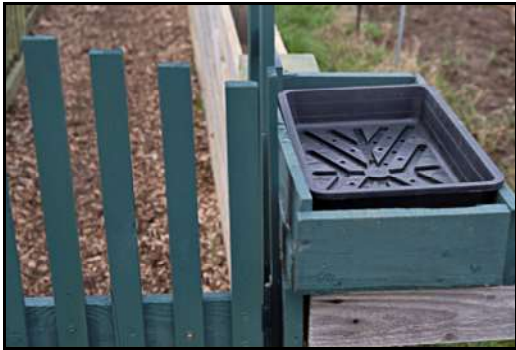
DSCF8846 ISO 500 X-T3 1/160 sec at f / 5.6