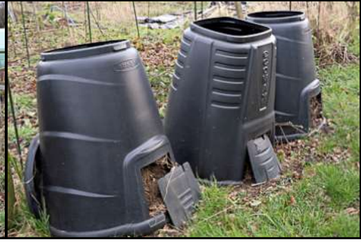
DSCF8759 ISO 400 X-T3 1/50 sec at f / 8.0