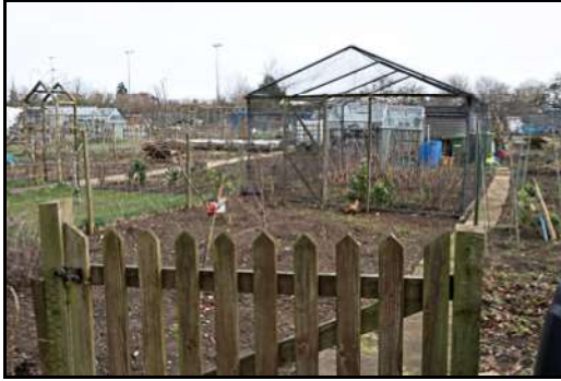
DSCF8882 ISO 400 X-T3 1/400 sec at f / 8.0