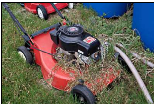
DSCF8793 ISO 400 X-T3 1/100 sec at f / 6.4