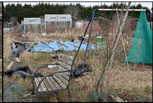
DSCF8768 ISO 400 X-T3 1/125 sec at f / 8.0