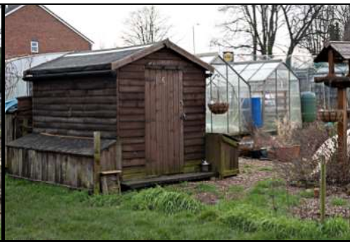
DSCF8782 ISO 400 X-T3 1/80 sec at f / 8.0