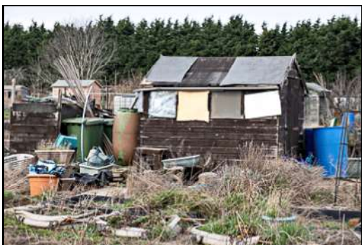
DSCF8795 ISO 400 X-T3 1/200 sec at f / 6.4