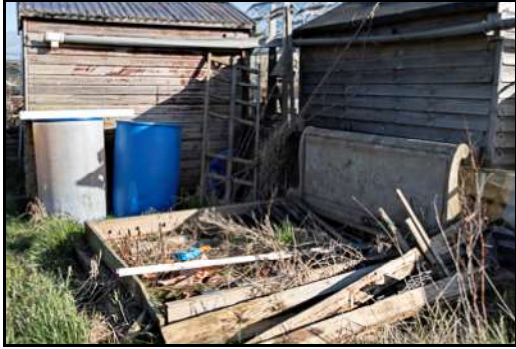
DSCF9006 ISO 400 X-T3 1/200 sec at f / 10