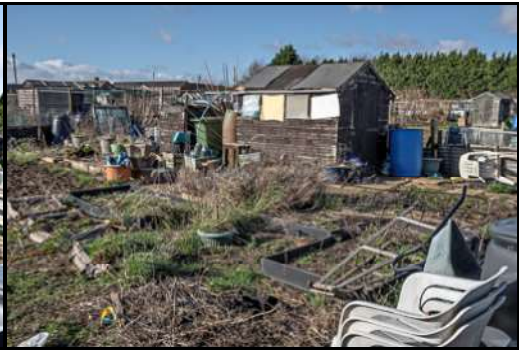
DSCF8985 ISO 400 X-T3 1/640 sec at f / 10