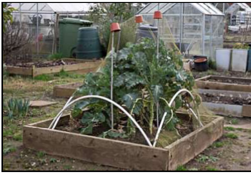
DSCF8769 ISO 400 X-T3 1/160 sec at f / 8.0