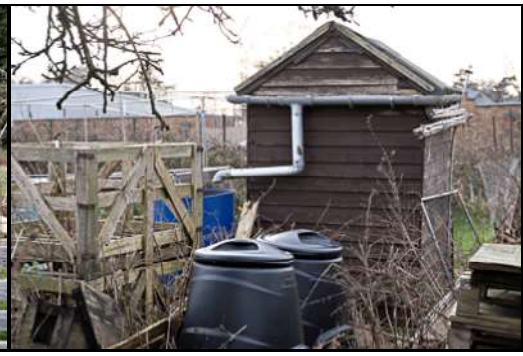
DSCF8842 ISO 500 X-T3 1/160 sec at f / 5.6