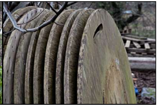
DSCF8813 ISO 400 X-T3 1/125 sec at f / 6.4