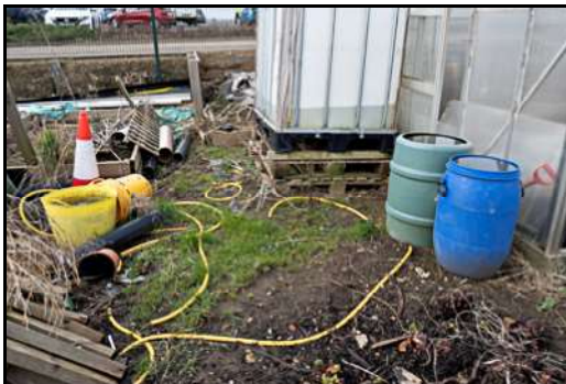
DSCF8885 ISO 400 X-T3 1/160 sec at f / 8.0