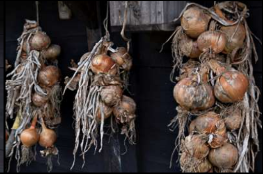
DSCF8830 ISO 500 X-T3 1/100 sec at f / 5.6