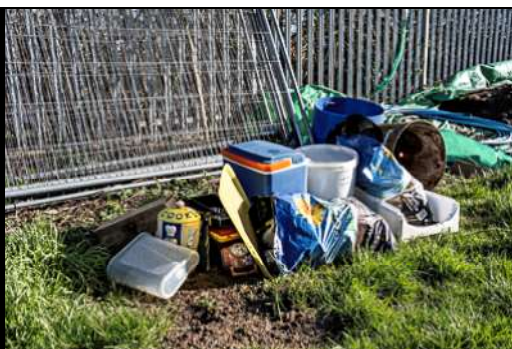
DSCF8988 ISO 400 X-T3 1/320 sec at f / 10