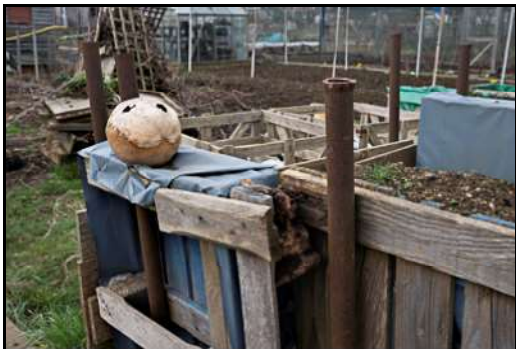
DSCF8790 ISO 400 X-T3 1/160 sec at f / 6.4