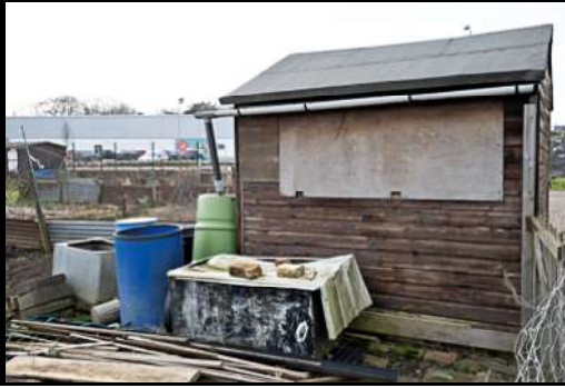
DSCF8730 ISO 160 X-T3 1/60 sec at f / 13