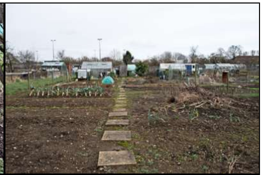
DSCF8753 ISO 400 X-T3 1/200 sec at f / 8.0