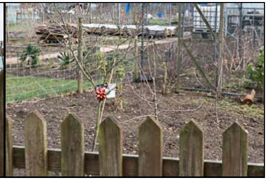
DSCF8881 ISO 400 X-T3 1/400 sec at f / 8.0