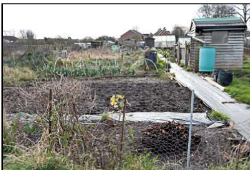
DSCF8877 ISO 400 X-T3 1/320 sec at f / 5.6