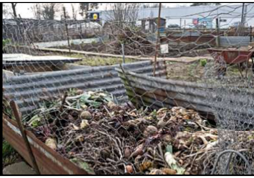
DSCF8728-Edit ISO 160 X-T3 1/25 sec at f / 13