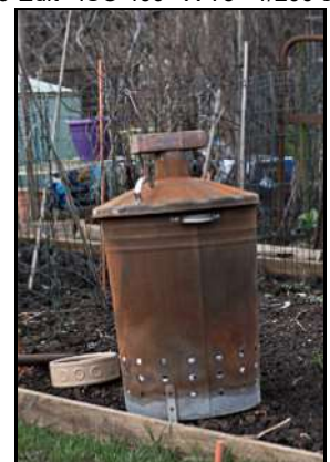
DSCF8797 ISO 400 X-T3 1/160 sec at f / 6.4