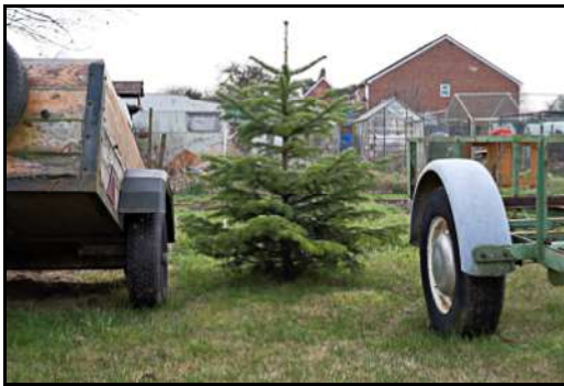
DSCF8778 ISO 400 X-T3 1/125 sec at f / 8.0